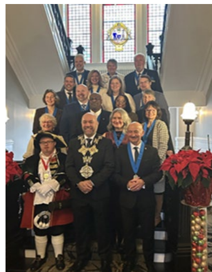
New Year's Day Levee

Each Councillor has a small fund that can be used to support non-profits to undertake activities that will benefit the community. To apply we require a letter of request, including the name and address of the non-profit group, and explanation of how the funds will be used and a completed Capital Request Form .