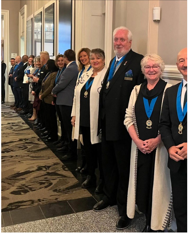
Great turn out to the 2025 City Hall New Year's Levee. Happy New Year HRM!

For more information on municipal winter operations, please visit our <u>website</u>.