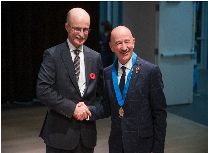
Regional Council swearing-in ceremony on November 5, 2024