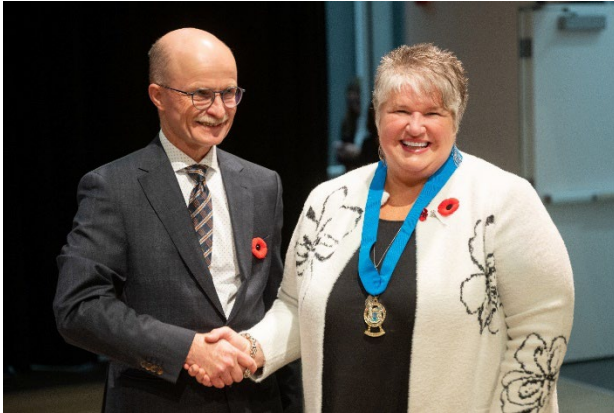
2024-2028 Muncipal Council Swearing In Ceremony