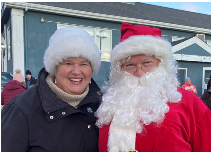
Hanging out with Santa at the Eastern Passage Holiday Parade Of Lights!