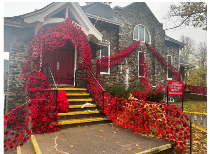
Poppy Tribute Show in support of our service men and women.

Given that many municipal programs, services and responsibilities directly affect lake health and water quality, the municipality is uniquely positioned to monitor water quality and address emerging issues, as well as ongoing concerns. For more information, read the staff report .