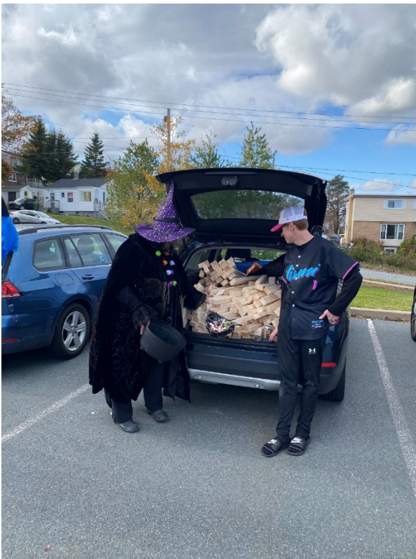
Southdale Academy's 1 st Trunk or Treat event!

Valour Way and the new roundabout will be fully operational with a temporary connection to Nora Bernard Street. Cogswell Street, from Brunswick Street to Upper Water Street, will also open on December 16. To learn more about the Cogswell District project, visit our website .