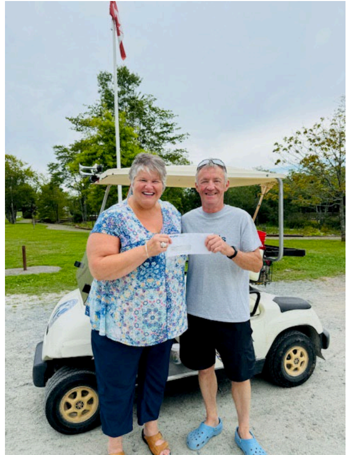
Presenting a donation to the Kiwanis Club for Park Beautification

For more information on the municipality's Open Data program, and to access all the datasets, visit the open data hub .