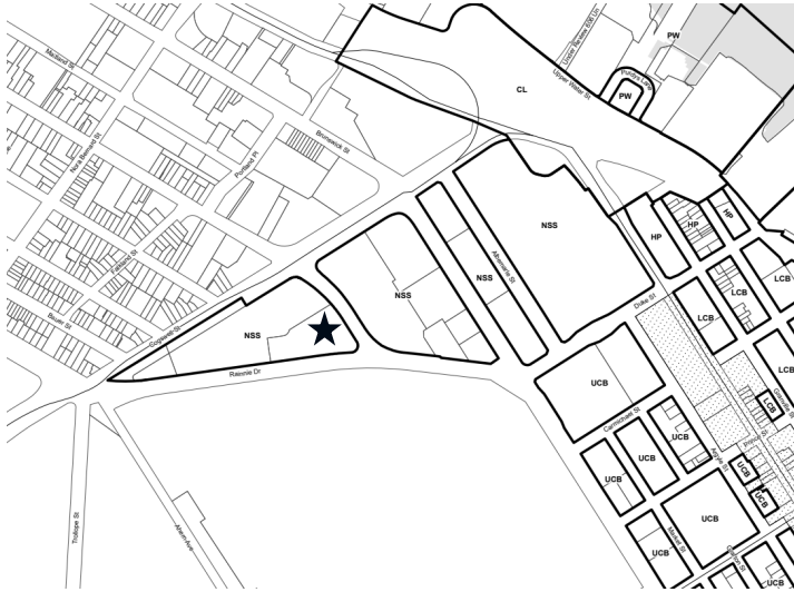
Map 2 – Downtown Dartmouth & Downtown Halifax Precincts