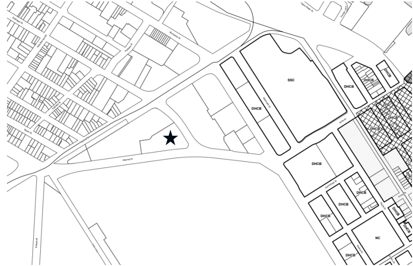
Schedule 3B – Downtown Halifax Special Areas