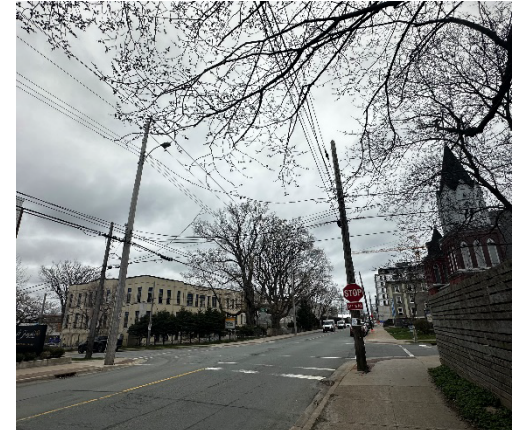
Gottingen Street facing south (May 2024)