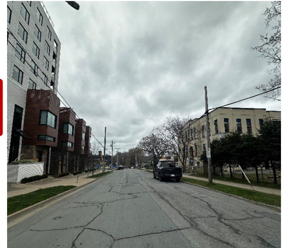
Russell Street facing east (May 2024)