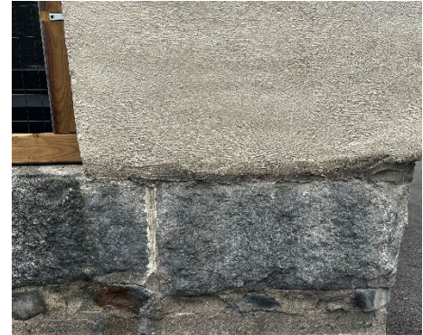
Stucco parging and granite block and stone foundation (May 2024)