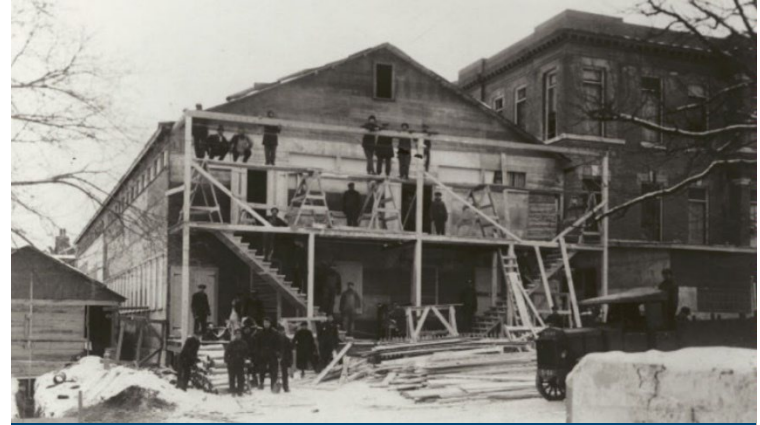
Temporary Dining Hall for Reconstruction Workers after the Halifax Explosion, with 5450 Russell Street to the right