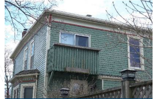
New added balcony