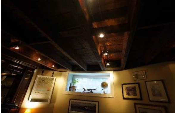
Structural elements in basement