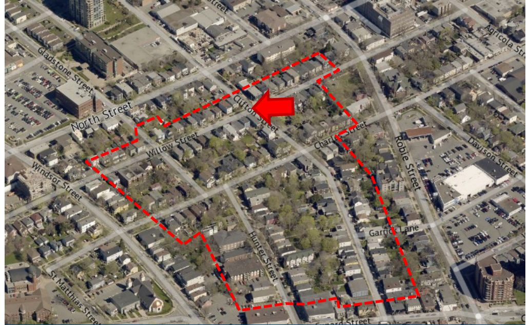
The proposed Young-Woodill Heritage Conservation District study area and the subject building