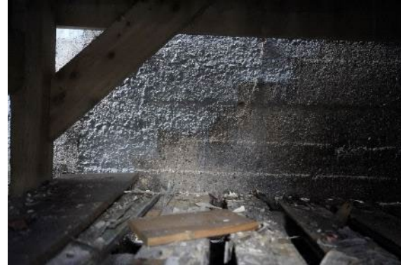
Poured concrete foundation