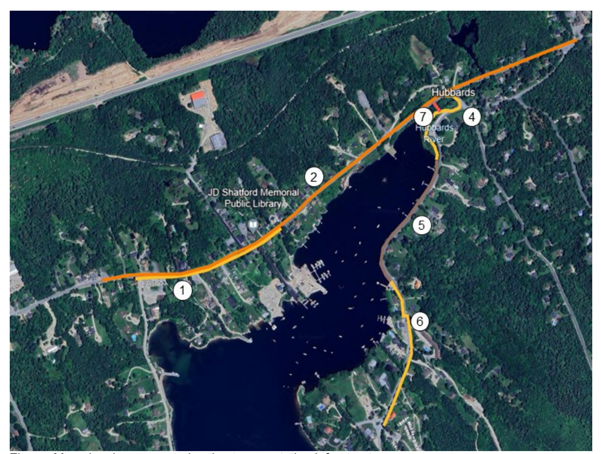
Figure: Map showing requested active transportation infrastructure