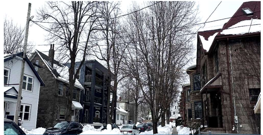
View of Henry Street near Jubilee Road Intersection (February 2024)