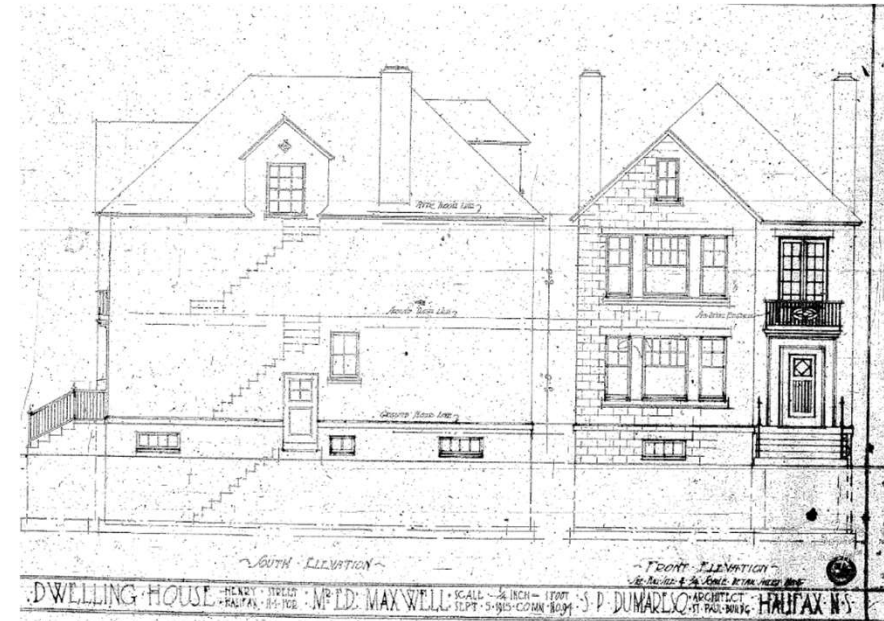
S.P. Dumaresq Building Blueprints for 1735 Henry Street dated 1915