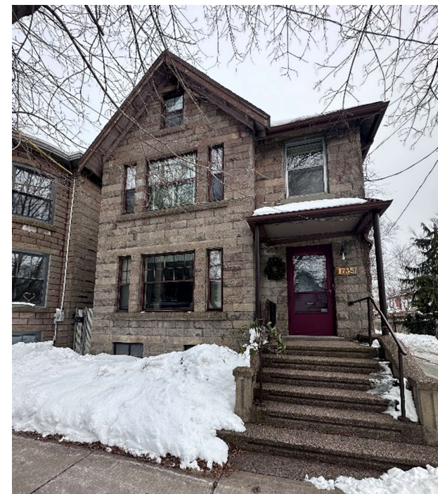
1735 Henry Street (February 2024)