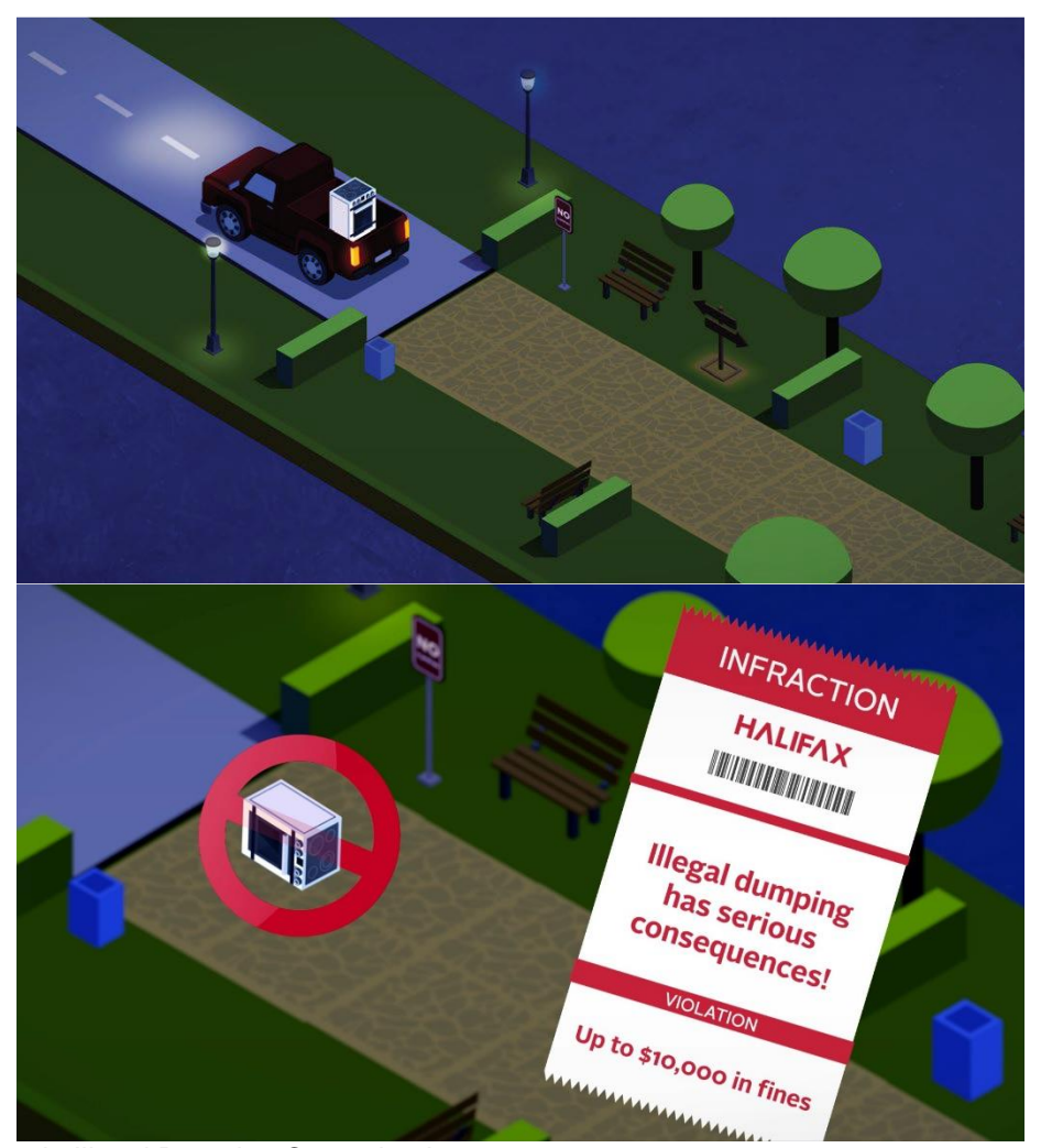
Figure 1: Sample Illegal Dumping Campaign Images

This messaging has been incorporated into the regular SWR communications plan, with campaigns running periodically through the year. Residents can learn about how to report illegal dumping, view statistics and download resources on how to mitigate dumping by visiting www.Halifax.ca/illegaldumping.