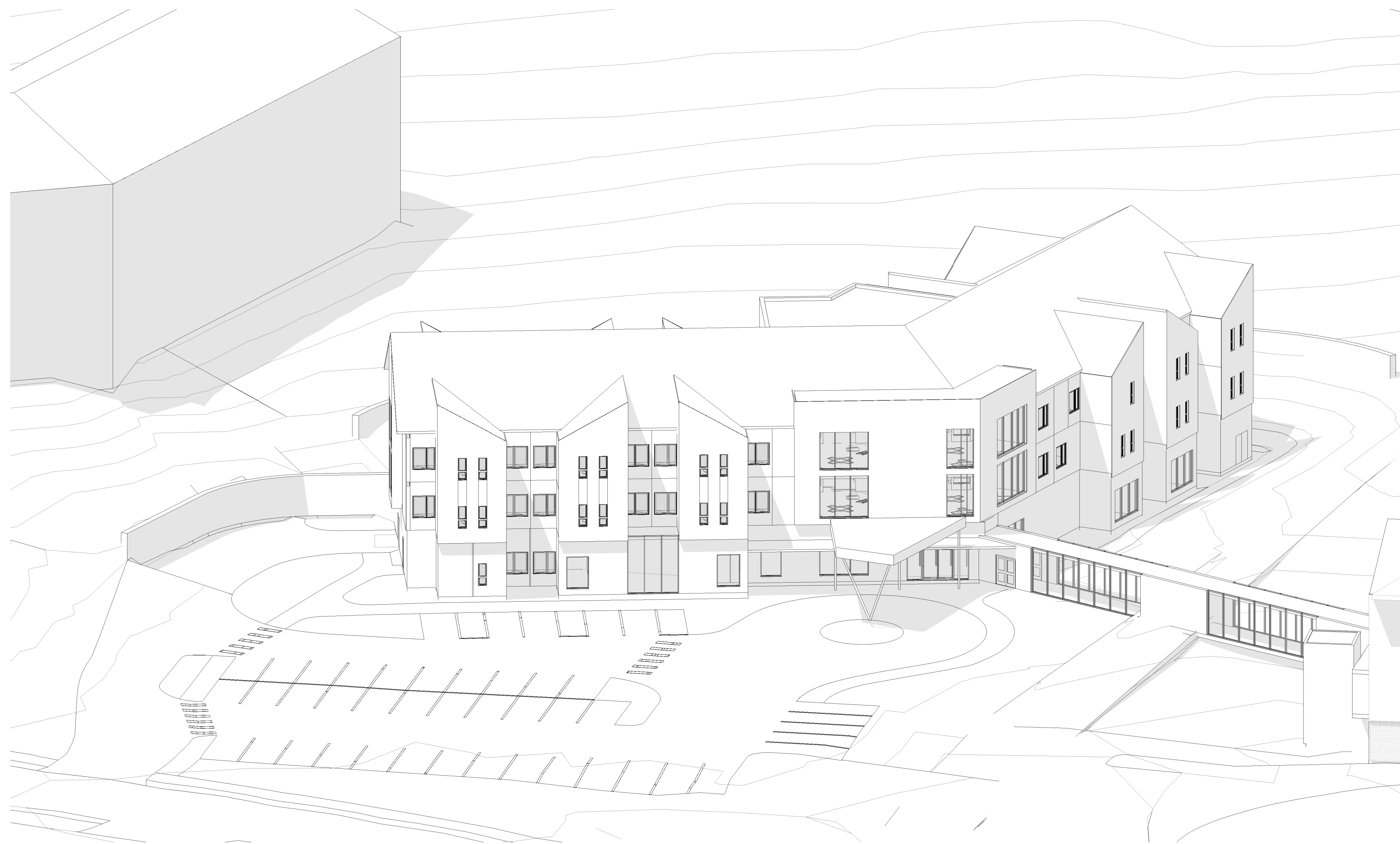
1 3D OF BUILDING CONCEPT WITH SITE