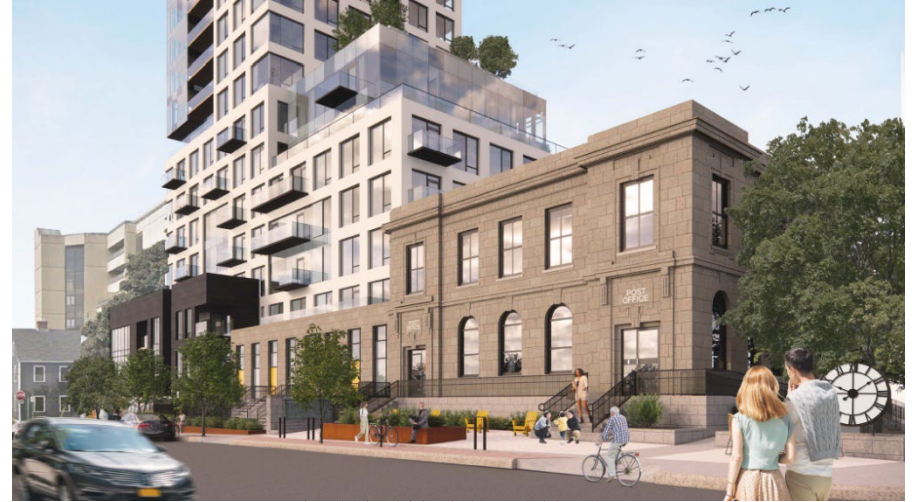
Rendering showing Queen Street elevation