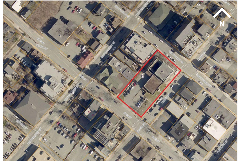
Site Boundaries in Red