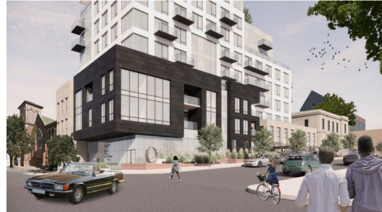
Rendering from corner of Queen and King Streets