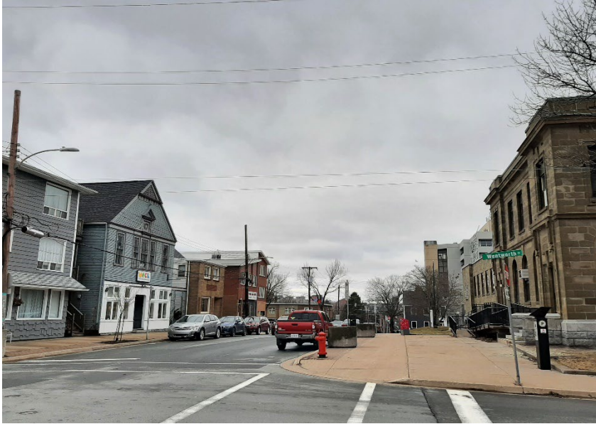
Queen and Wentworth Streets