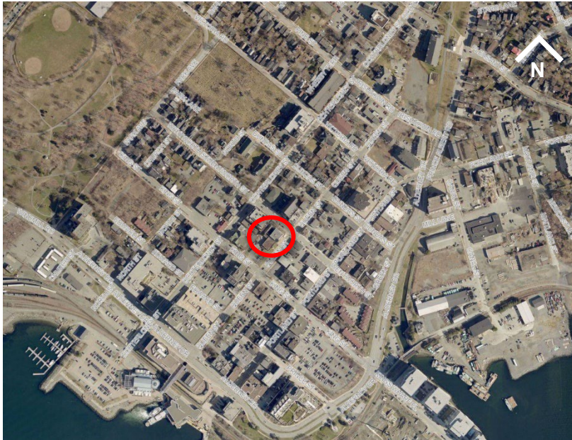
General Site location in Red