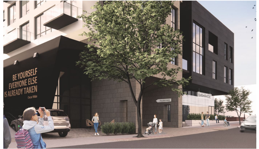
Rendering showing King Street elevation