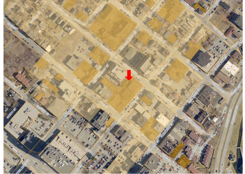
Heritage Properties and proposed Downtown Dartmouth HCD. Subject property identified by red arrow