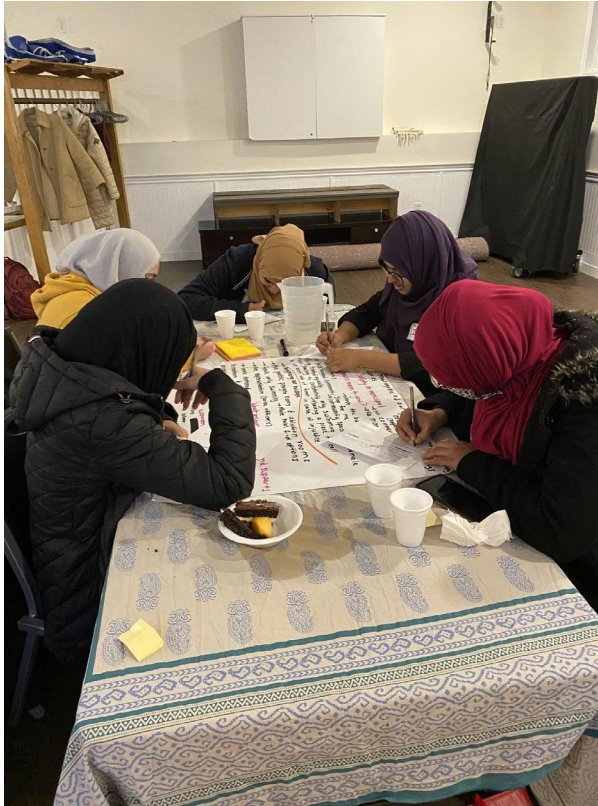
Participants at Dartmouth Masjid session