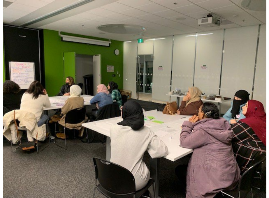
Participants at Halifax Central Library session