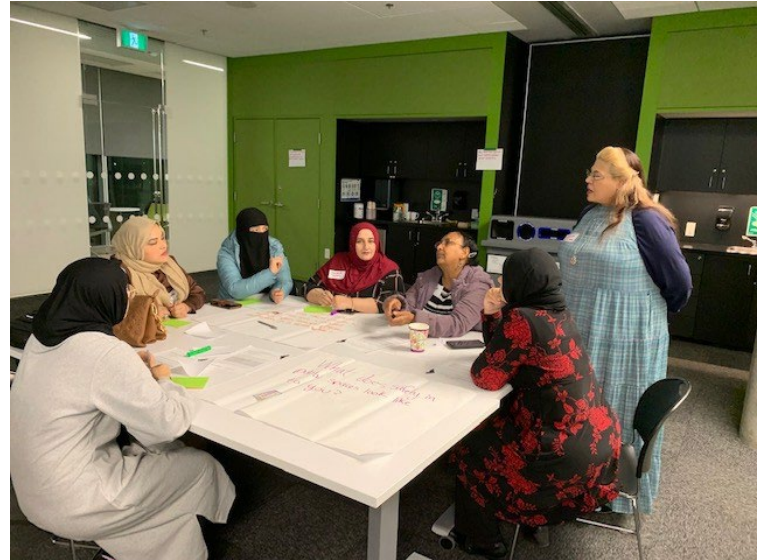
Participants at Halifax Central Library session