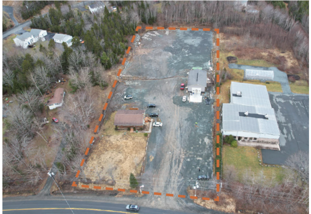
Figure 2: Aerial Photograph of site taken by UPLAND on January 11, 2024 (dashed line showing approximate property dimensions).