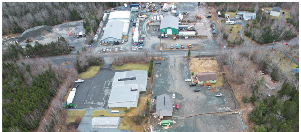
Figure 3: View across Windgate Drive on the other (southern) side of the road.

The site is located close to the three-way intersection of Windgate and Rivendale Drives. This point of Windgate Drive is located at about 1.15 kilometres east of Beaver Bank Road, and about 3.5 kilometres west of Windsor Junction Road.