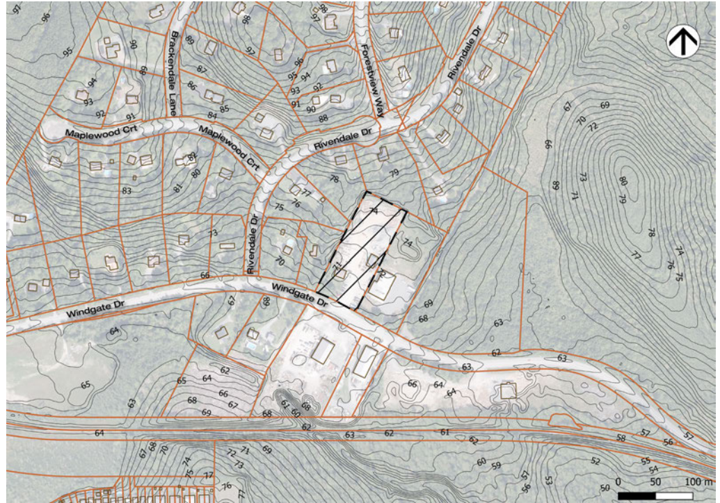
Figure 4: Context map

The neighbouring properties along Windgate Drive feature a mix of residential and industrial land uses. Immediately neighbouring properties on the same side of the road include a residential property and a commercial land use. The Rivendale Estates residential subdivision flanks the property's rear lot line