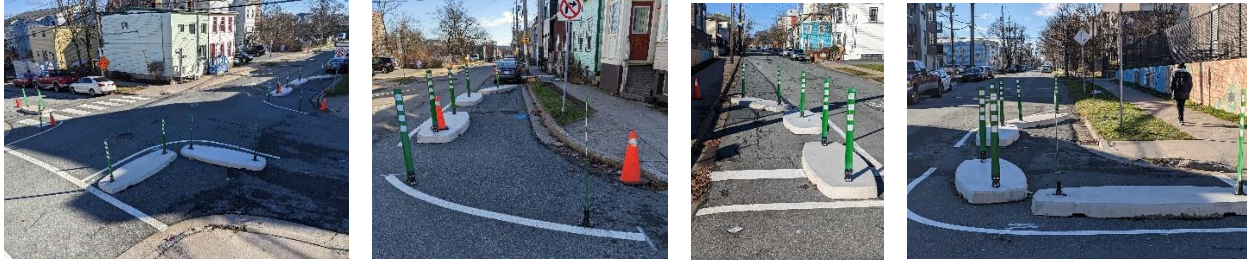
Examples of curb extensions that will be painted through this initiative.