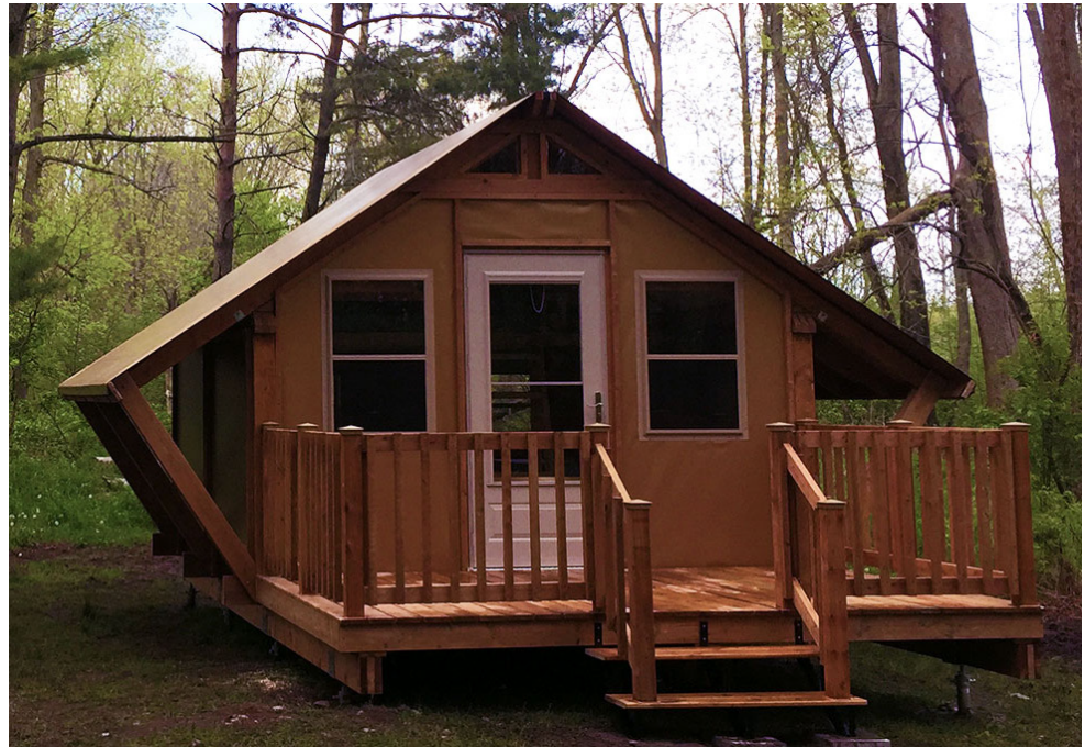
Figure 3: Typical cabin design

The owners of the property plan to add a campground to the northern, currently vacant end of the property. The campground would consist of 44 A-frame ‘glamping’ cabins, similar to the one depicted in Figure 3. These cabins are proposed to be the only type of accommodation on the campground. Tenting or RV sites are not a part of the proposal.