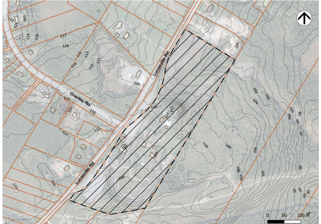
Figure 1: Site map

The subject of this planning application is property PID#40203648 registered to Santa's Village Inc. The 10.12 1 hectare property is situated on Lucasville Road in Hammonds Plains at the civic number 1200 on that road.