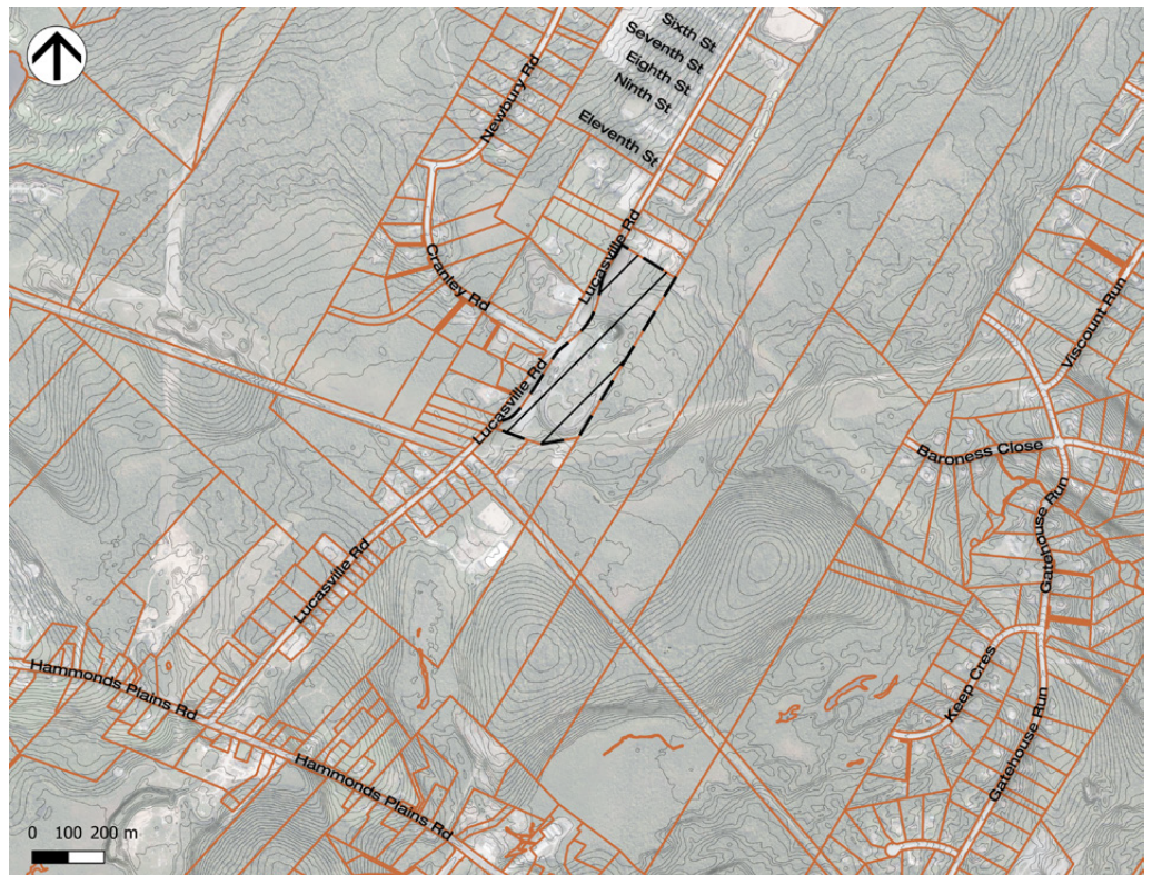
Figure 2: Context map

The neighbouring properties along Lucasville Road feature a mix of commercial and residential land uses. Immediately neighbouring properties on the same side of the road include a landscaping business, a Nova Scotia Power laydown yard and a contracting business. Across the street, two residential properties and an engineering firm are present. To the east, a large vacant wood lot flanks the property's rear lot line.