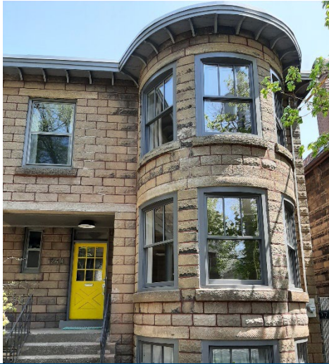
1741-1743 Henry Street (May 2023)