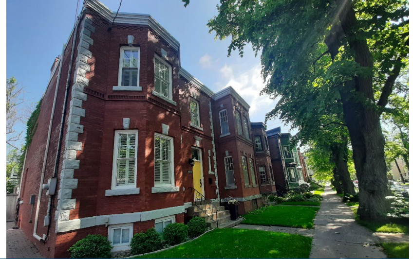
Jubilee Road and Henry Street rowhouses (June 2023)