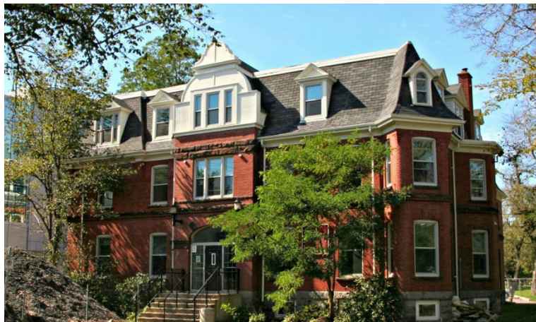
Infant's Home on Tower Road prior to demolition (Ziobrowski)