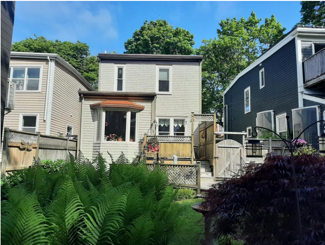
6038 Charles Street (June 2023)