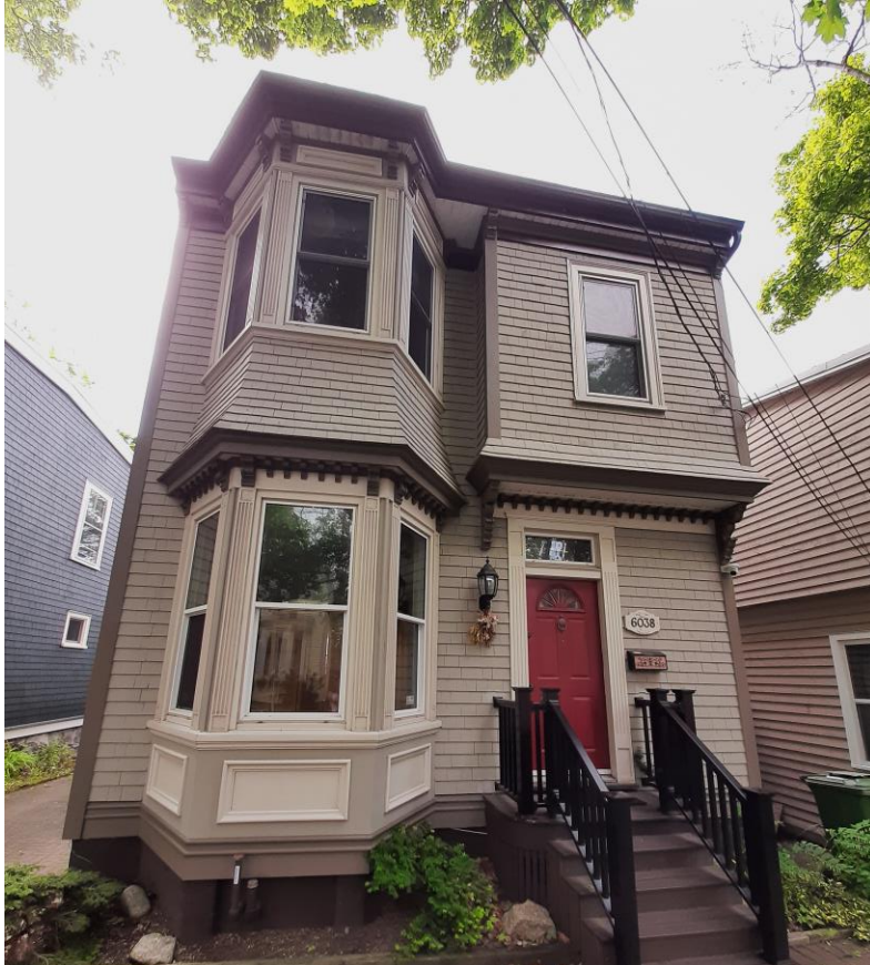
6038 Charles Street (June 2023)