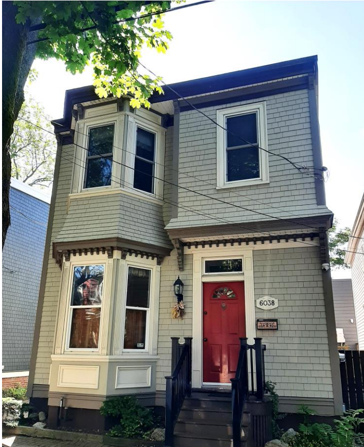
6038 Charles Street (June 2023)