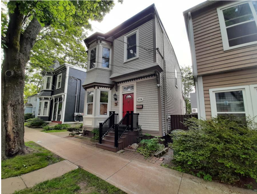
6038 Charles Street (June 2023)