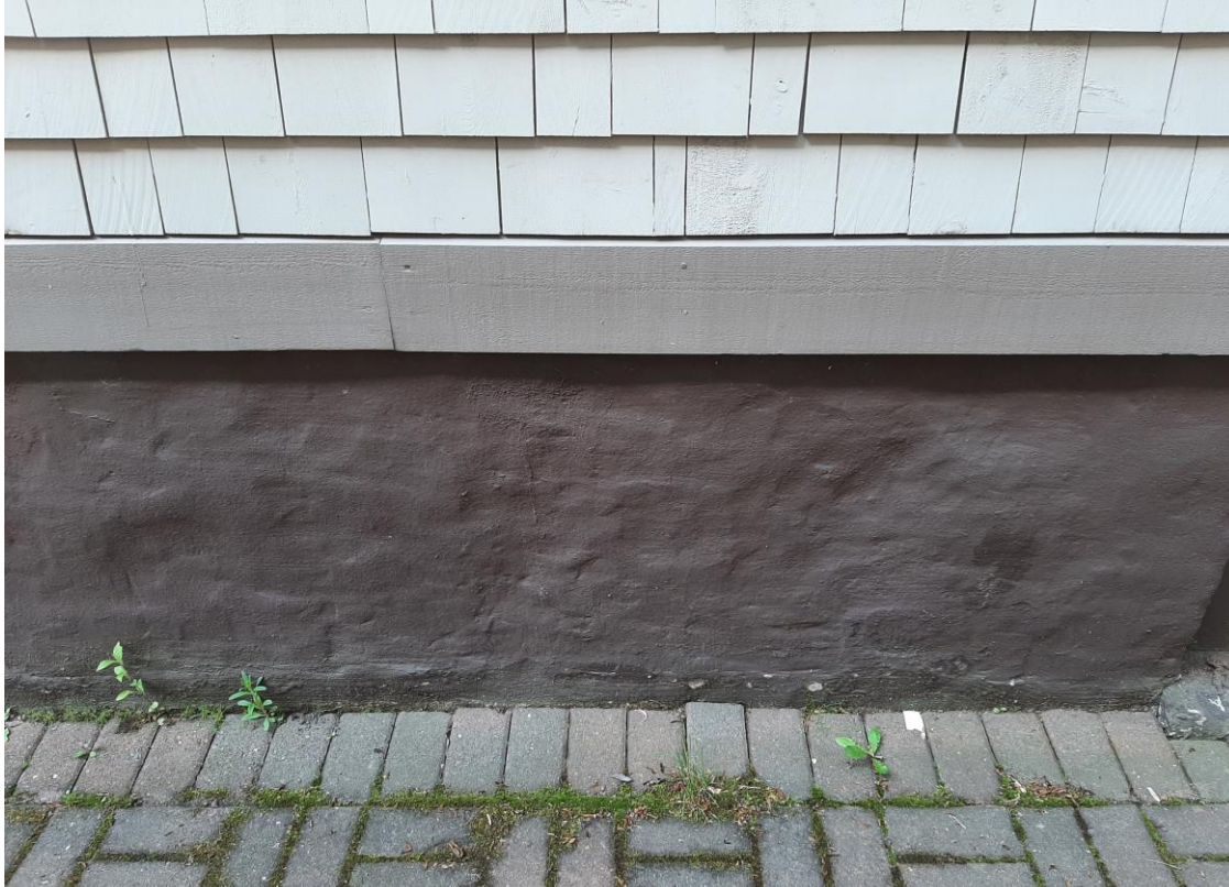
6038 Charles Street Foundation (June 2023)