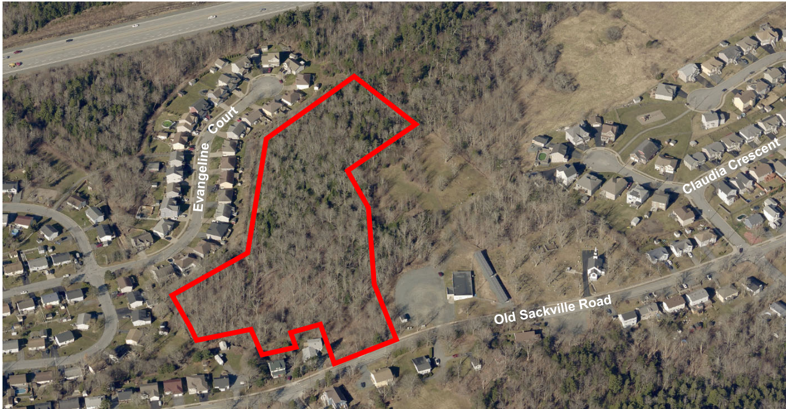
Approximate representation of parcel RL-1. Accuracy not guaranteed, see instead Attachment A – Plan of Survey.