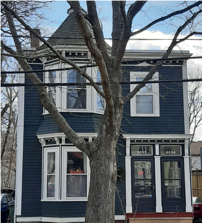
6032-6034 Charles Street (February 2023)