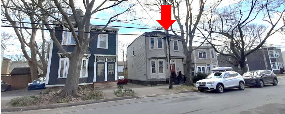
6038 Charles Street