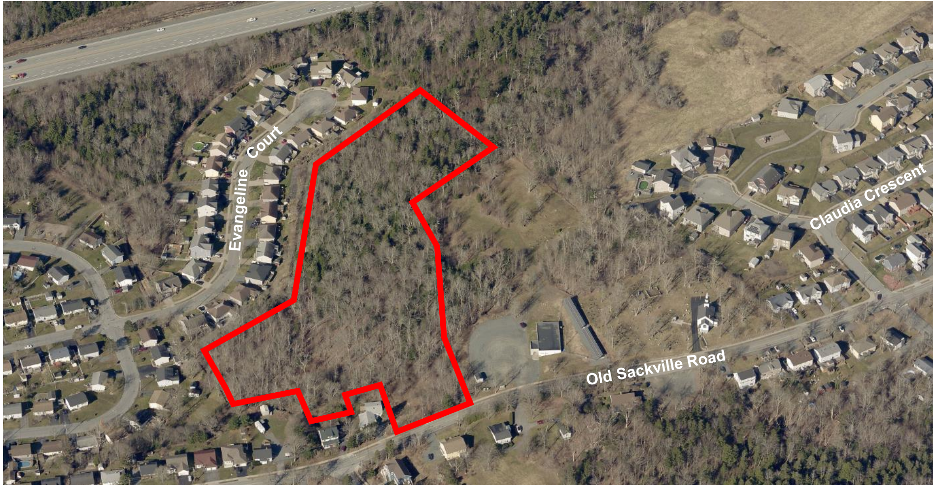
Approximate representation of parcel RL-1. Accuracy not guaranteed, see instead Attachment A – Plan of Survey.