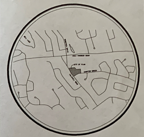
KEY PLAN SCALE: NTS