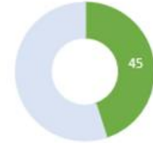
Dartmouth Harb. East No. 1