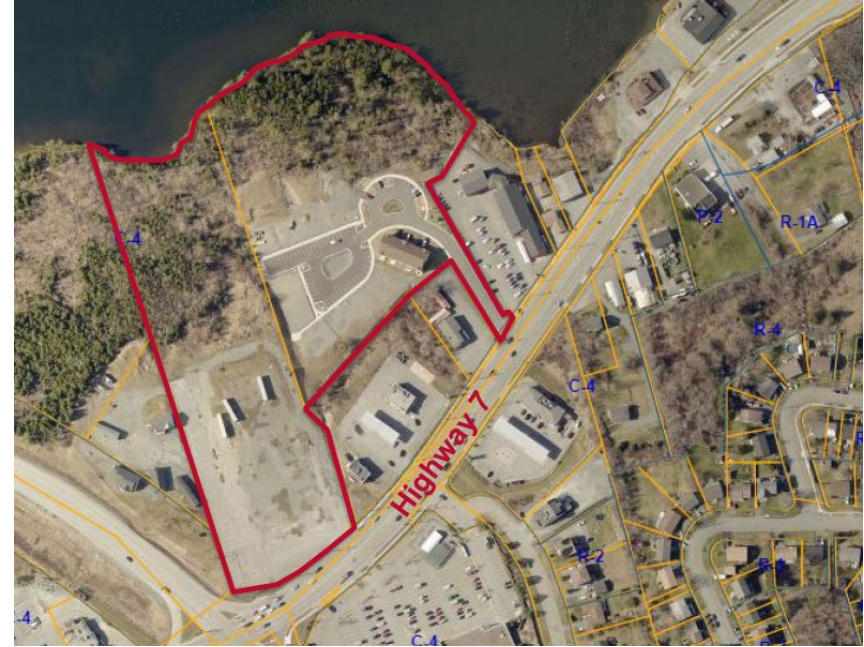
Site Boundaries in Red