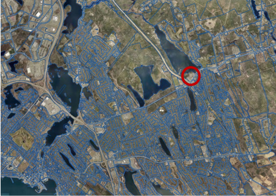
General Site location in Red