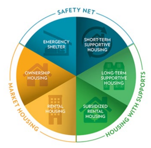
Figure 2: Wheelhouse Model

Respective obligations under these decampment MOUs are detailed in Table 4 (see below).