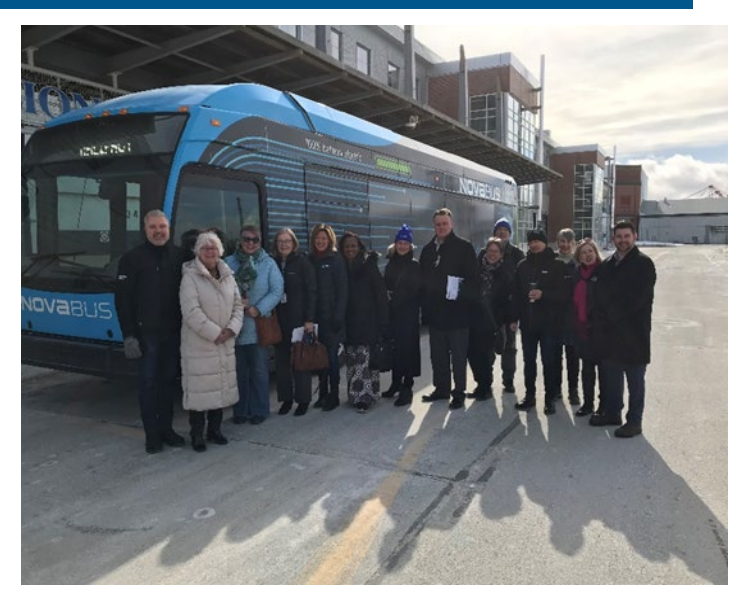
Council eBus demo!

of positions available in recreation programming, aquatics and inclusion support. These fun summer jobs pay $16.30 to $19.30 per hour. Visit our website for a full list of postings until April 16<sup>th</sup>.