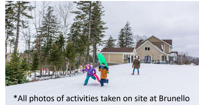
*All photos of activities taken on site at Brunello