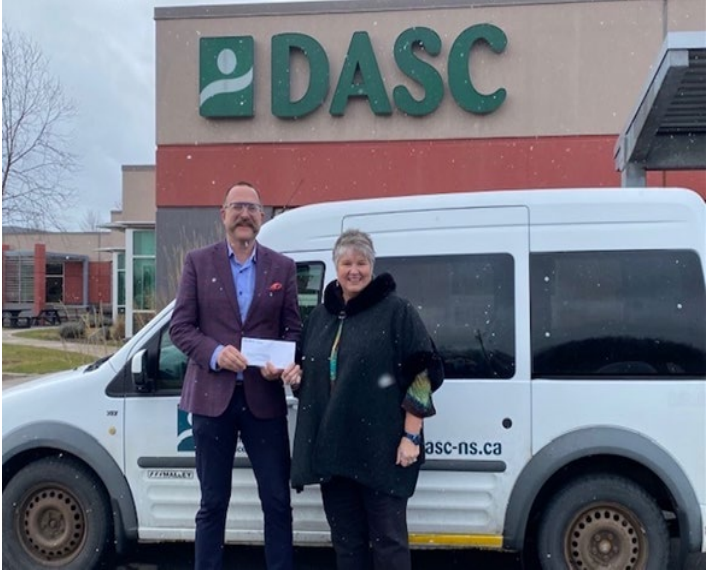
Dartmouth Adult Services Centre cheque presentation for funds to assist in purchasing a new accessible vehicle for their programming.

For further information, please email nonprofitgrants@halifax.ca or call 902.490.7310.