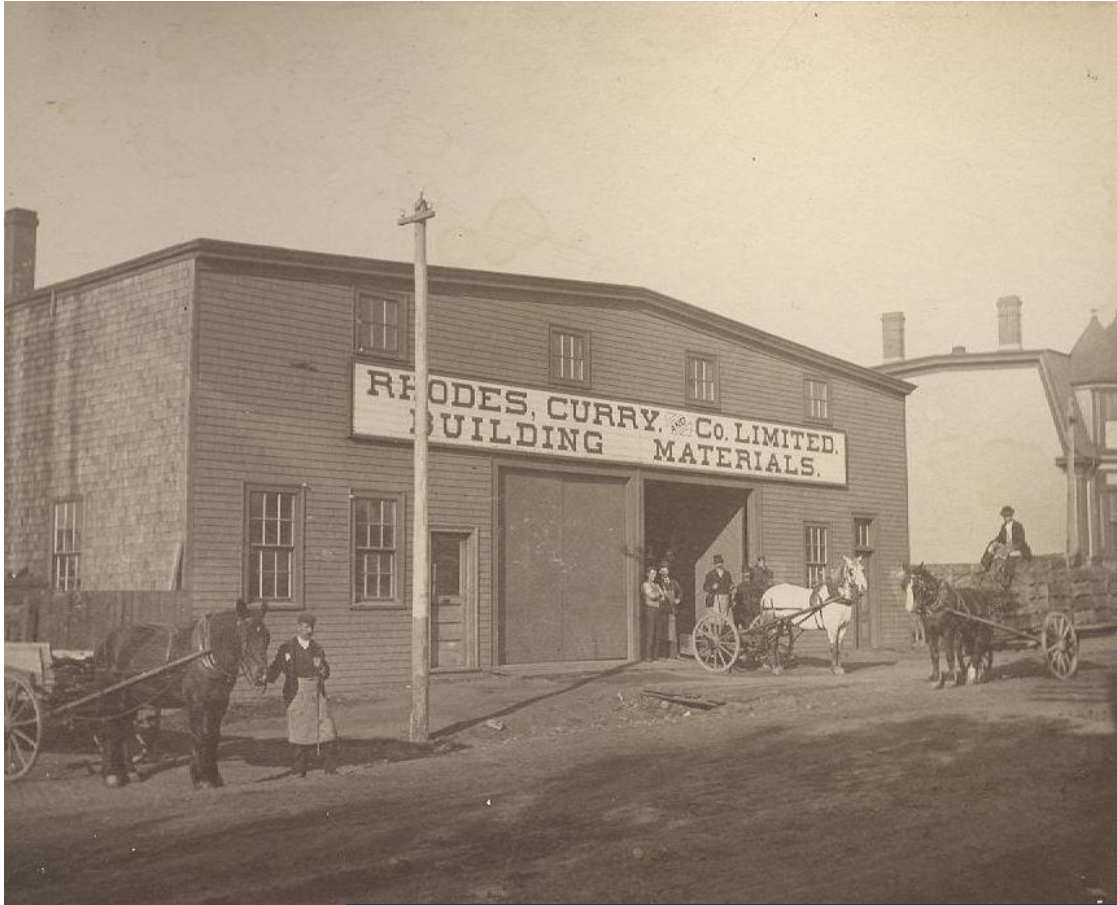
Halifax Branch of Rhodes, Curry & Co. Ltd