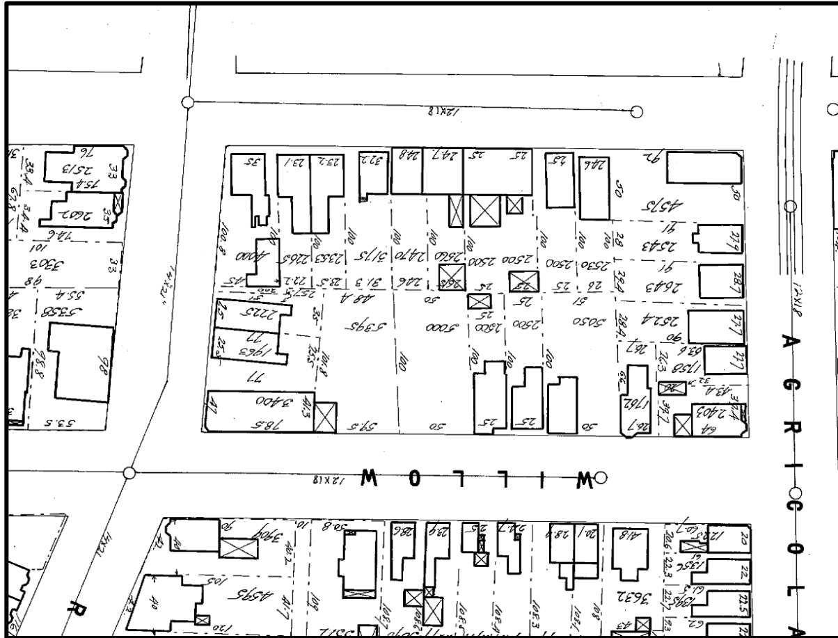
c. 1918 Assessment Map