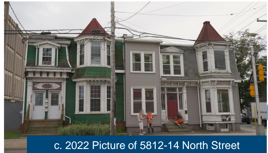
c. 2022 Picture of 5812-14 North Street