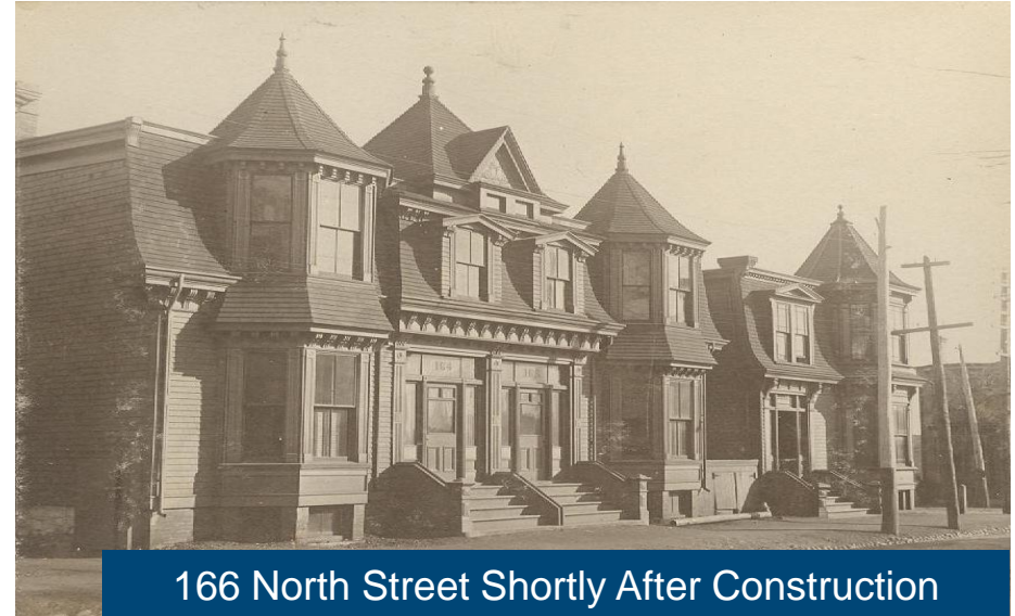
166 North Street Shortly After Construction