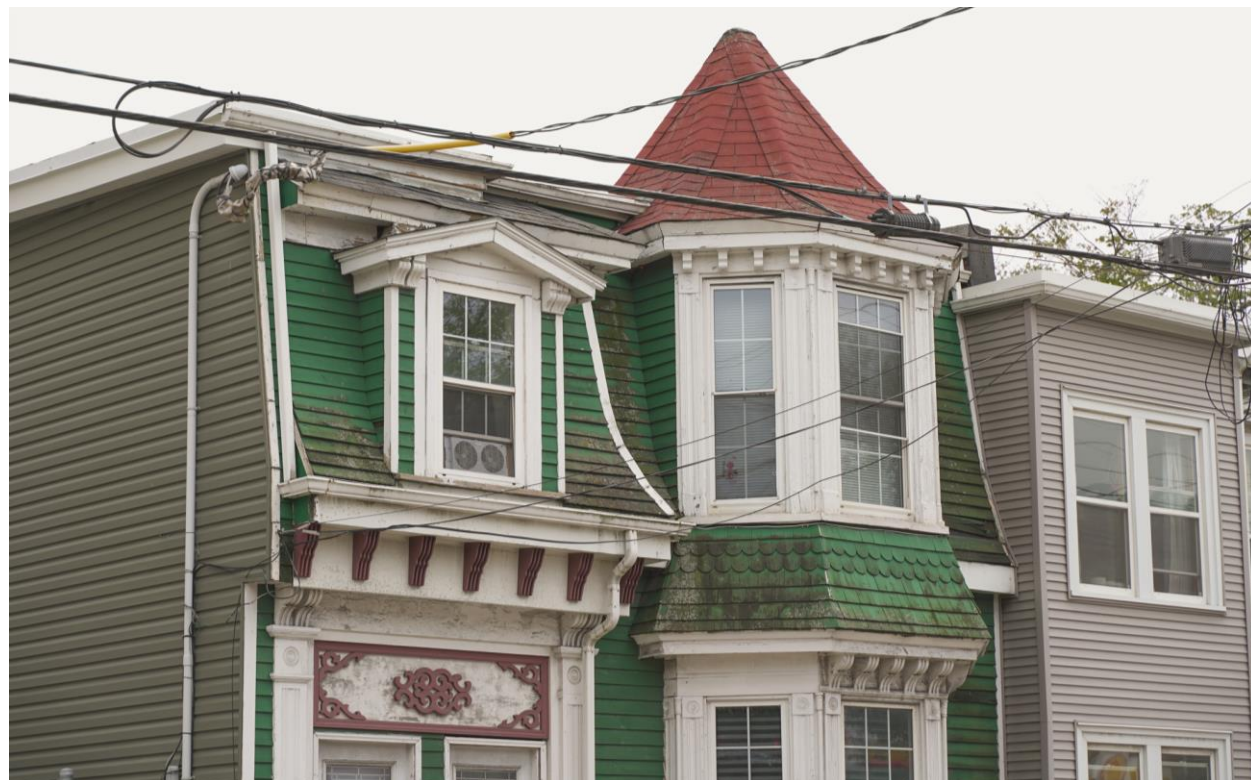
c. 2022 Picture of 5812-14 North Street