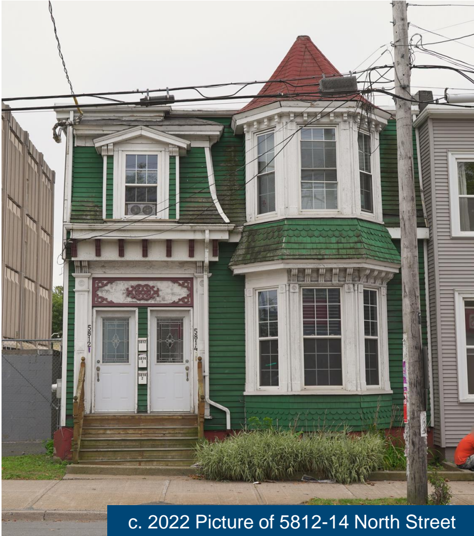
c. 2022 Picture of 5812-14 North Street