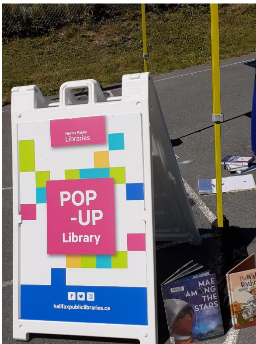
Pop up library in Beechville this summer