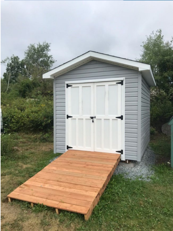
New shed at BLT community garden – a district funding project

TIMBERLEA - BEECHVILLE - CLAYTON PARK - WEDGEWOOD