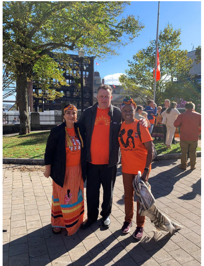
Truth and Reconciliation Day – Grande Parade – September 30