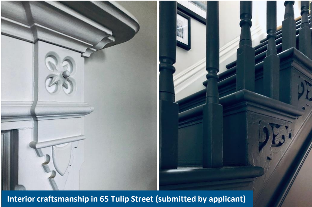
Interior craftsmanship in 65 Tulip Street (submitted by applicant)