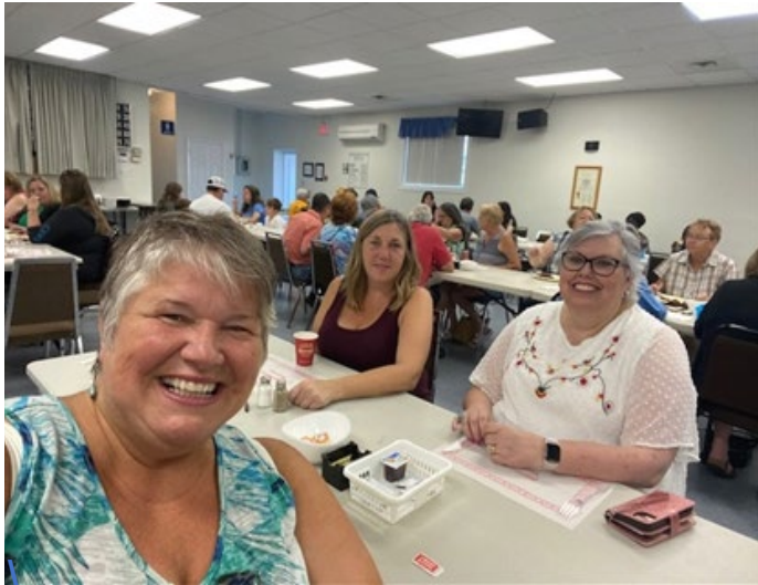
Eastern Passage Cow Bay Summer Carnival Senior's Tea Social