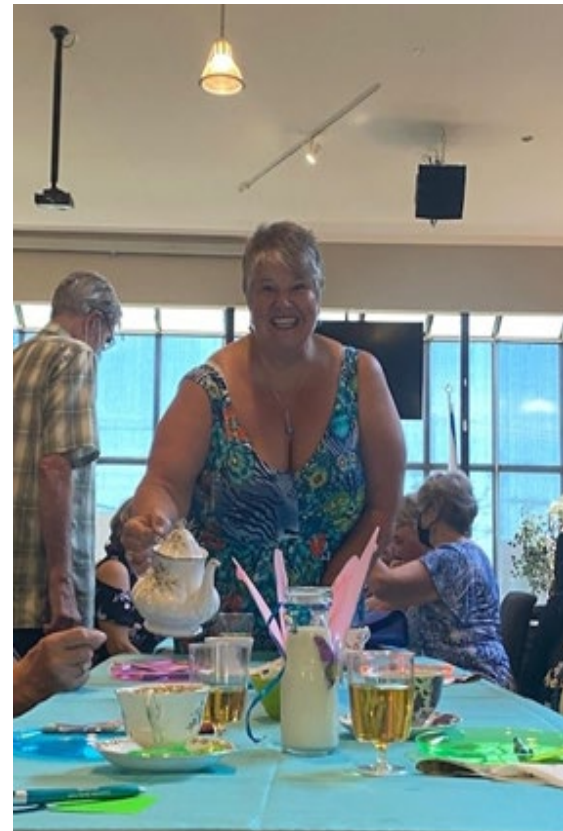
Dartmouth South Senior's Tea Social