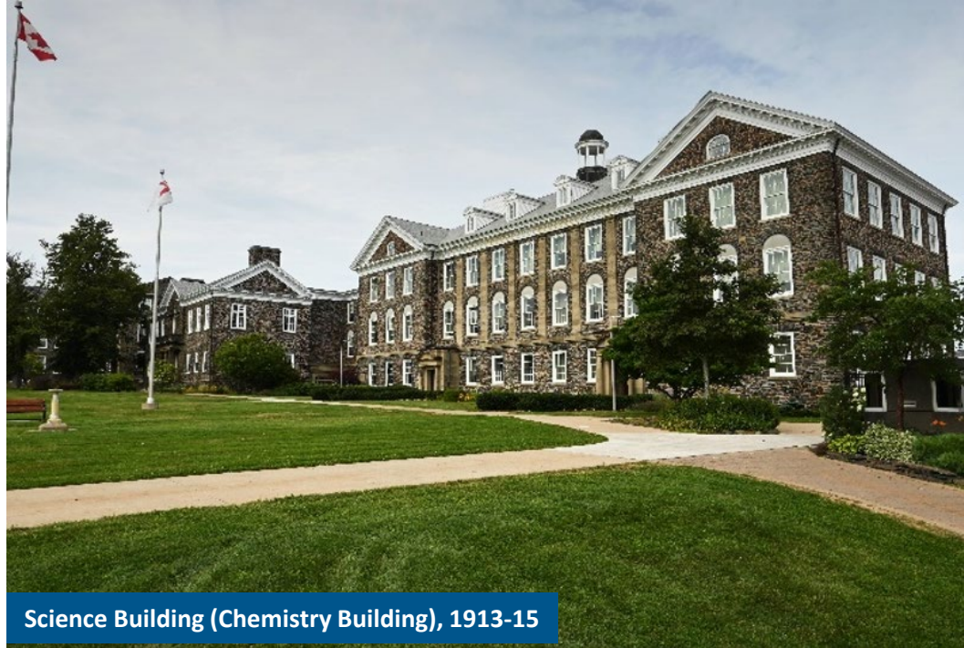
Science Building (Chemistry Building), 1913-15