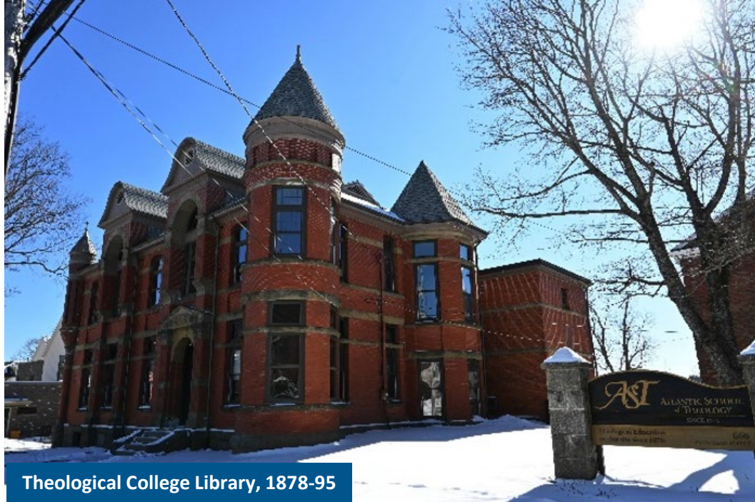
Theological College Library, 1878-95