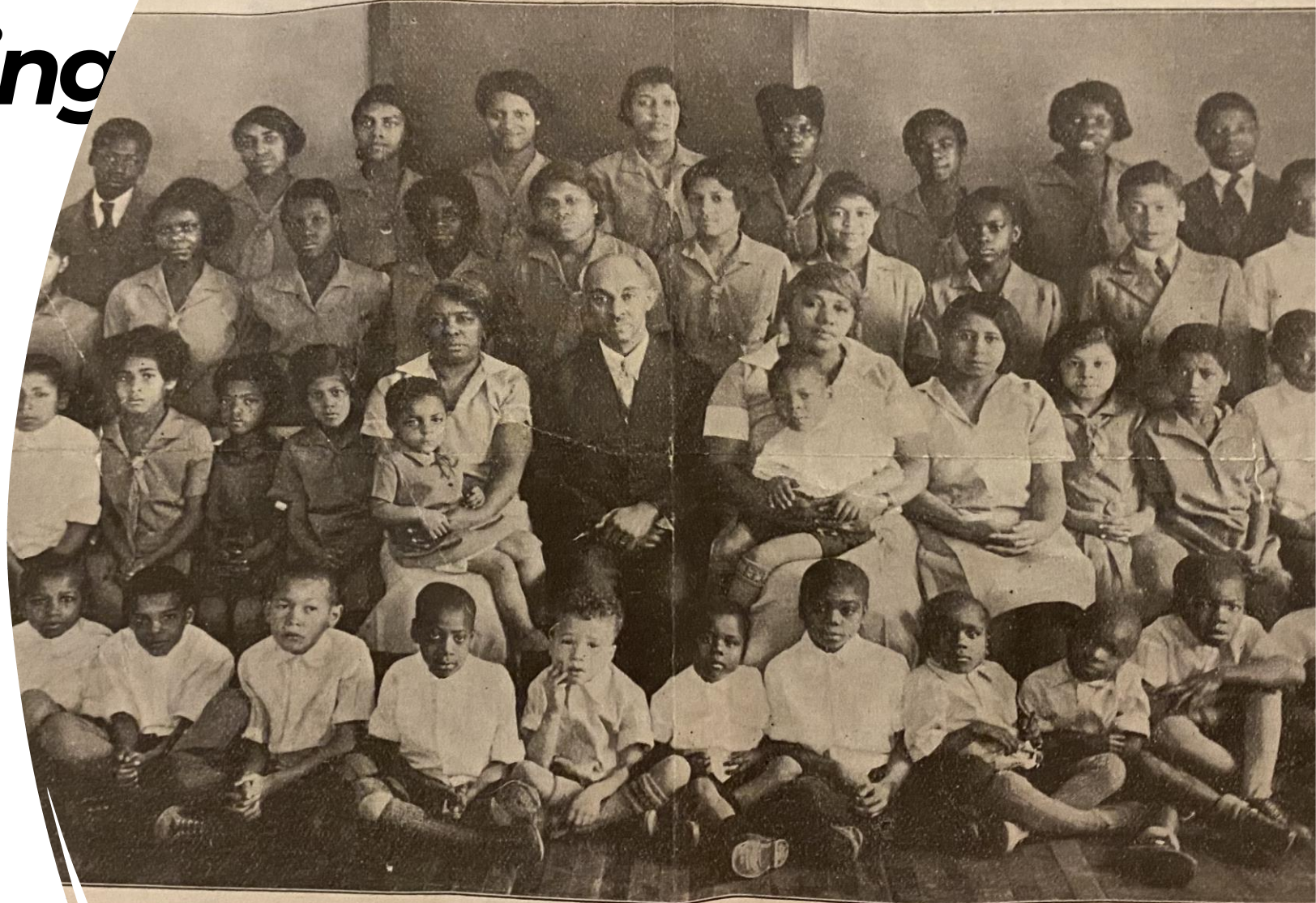
Children and Staff of The Nova Scotia Home for Colored Children