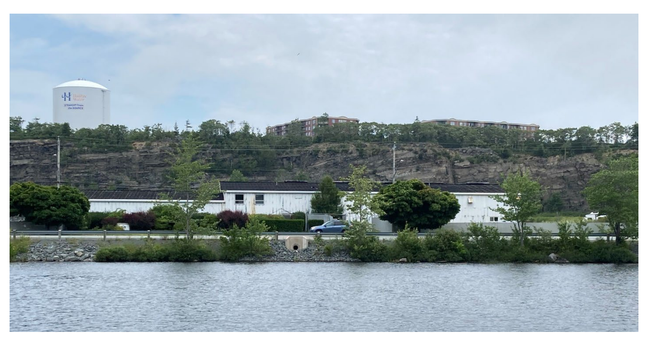
Figure 2: Riprap shoreline with partial vegetative cover along Kearney Lake Road.

The Blue Mountain-Birch Cove Lakes Wilderness Area (BMBC) is a 1767 ha provincial protected area located to the north and north-west of KL. This is a heavily used recreational area, with trails for hiking, biking, cross-country skiing, and snowshoeing. BMBC is currently a candidate to become a National Urban Park. Several lakes upstream from KL and LKL in the Kearney Run watershed are situated within BMBC, and used by canoers, kayakers, anglers, and swimmers.