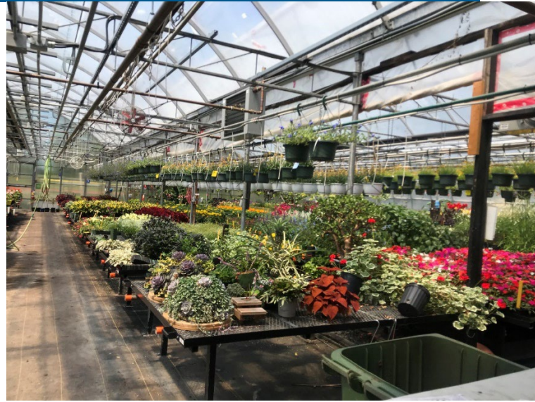
This is our HRM greenhouse off Caledonia Rd

Also, as a reminder, a summary offence ticket for leaving an animal unattended in a motor vehicle in conditions that could cause distress carries a fine of $697.50. If you see a pet in immediate distress, call 490-5020 and take directions from the call taker.