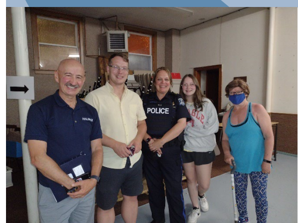
The Dartmouth North Neighbourhood Watch meeting, collaborating with the community to resolve issues. Thanks to all those who attended!

Our Recreation Access Program provides discounts on Halifax Rec Programs for families in need. However, the application process is currently fairly extensive and can be arduous for families who are already overburdened. I recently introduced a motion to have a staff report regarding reducing barriers to recreation for vulnerable communities including barriers to using Recreation Funding Access Program from the Affordable Access Program. You can find the full report request here .