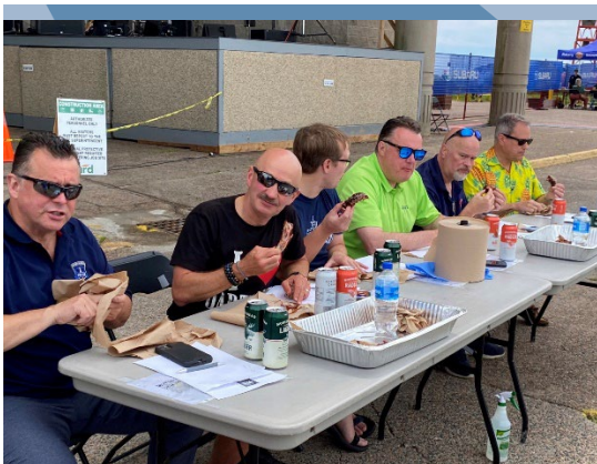
Judging at the RibFest in Dartmouth

Visit the municipality's web page, Burning Rules and Regulations , for more information.