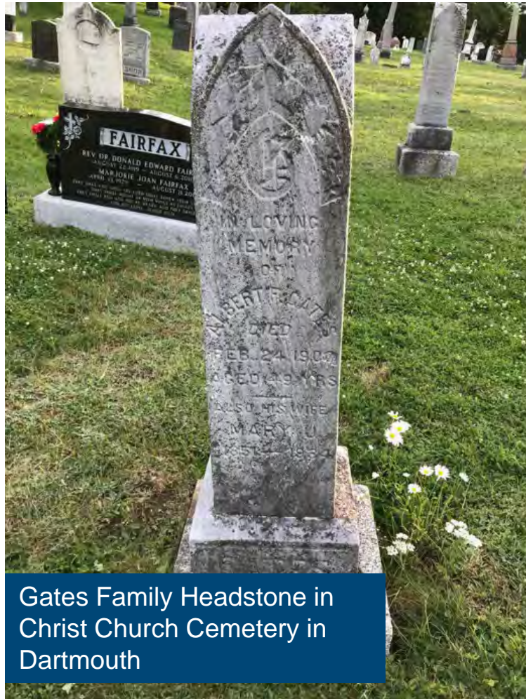
Gates Family Headstone in Christ Church Cemetery in Dartmouth