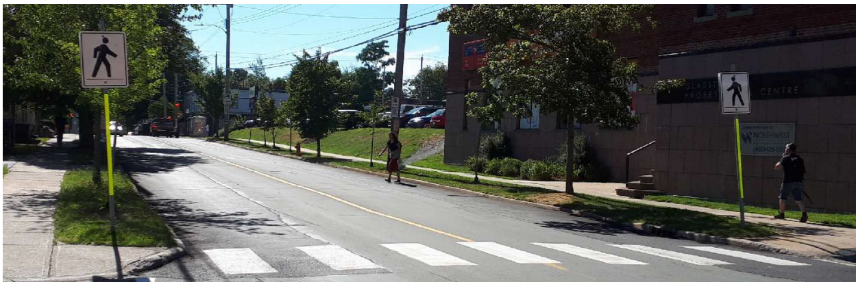
Reflective Signpost Treatment at Basic Marked Crosswalk

With the goal of improving the visibility of basic marked crosswalks (those with pavement markings and side mounted signs only) and make them more noticeable to drivers, staff undertook a project to apply reflective strips to the posts at these crosswalks. In total, fluorescent yellow/green reflective strips were applied to the posts at 353 crosswalks, beginning in 2018 and completed in 2019. Based on feedback received, the reflective strips have been very well received and provide a significant improvement to highlighting these crosswalk locations. Staff will continue with this treatment as part of typical installation for basic marked crosswalk installations.