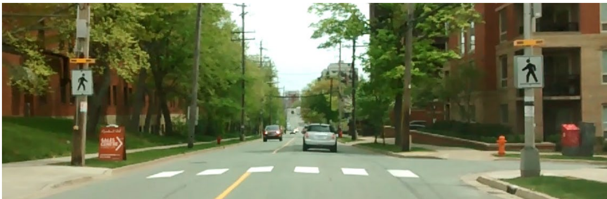
RRFB Enhanced Crosswalk

Staff has undertaken a review of all basic marked crosswalks (those with pavement markings and side mounted signs only) and identified locations where an upgrade to RRFB would be appropriate. The assessment resulted in 79 locations identified for upgrade with a further 36 locations where additional data would be required to make a final decision on whether the location would be appropriate for upgrade.