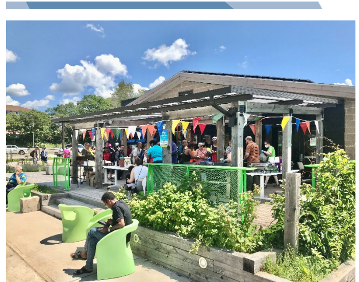
Dartmouth North Public Library Barbecue Event!