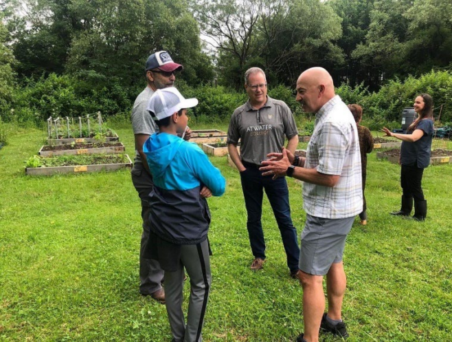
Had a great time at the 2 nd Annual Landrace Community Garden Opening.

The 2022 competition is expecting 100-115 athletes from 18 different countries. Regional Council approved an event grant of $10,000 from the 2022/2023 Community and Events Reserve for the championships. Keep an eye on their facebook page for more information.