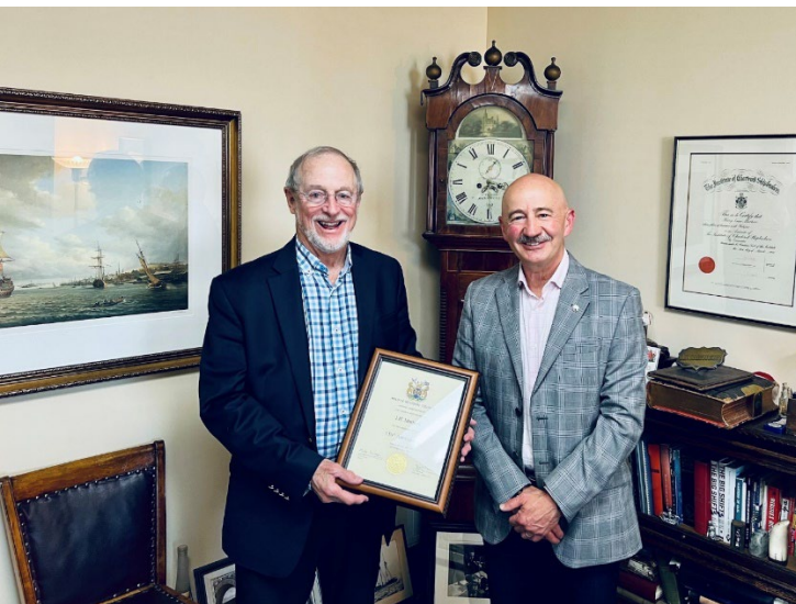
Celebrating 150 years with I.H. Mathers