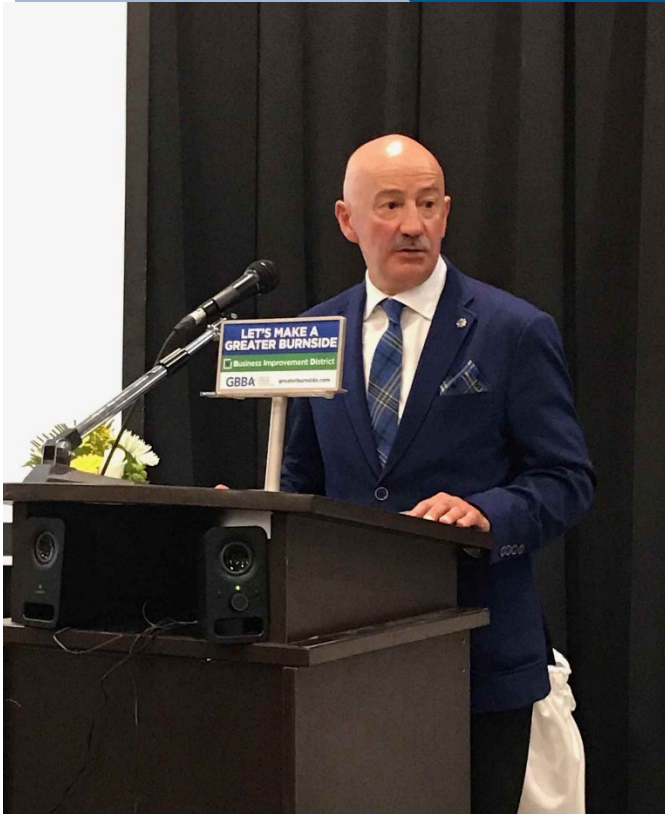
Speaking at the Greater Burnside Business Association Luncheon