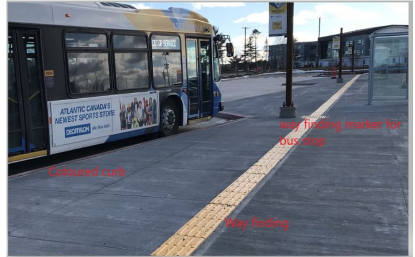
Image Description: A bus stop at the West Bedford Park and Ride with accessibility features installed. These features are labeled with red text which read “Coloured curb,” “Wayfinding,” and “Way finding marker for bus stop” respectively.

Based on the bus stop inventory completed in partnership with TPW, there have been a total of 731 identified bus stops that require accessibility upgrades; these bus stops are currently being categorized by priority level and investment required.