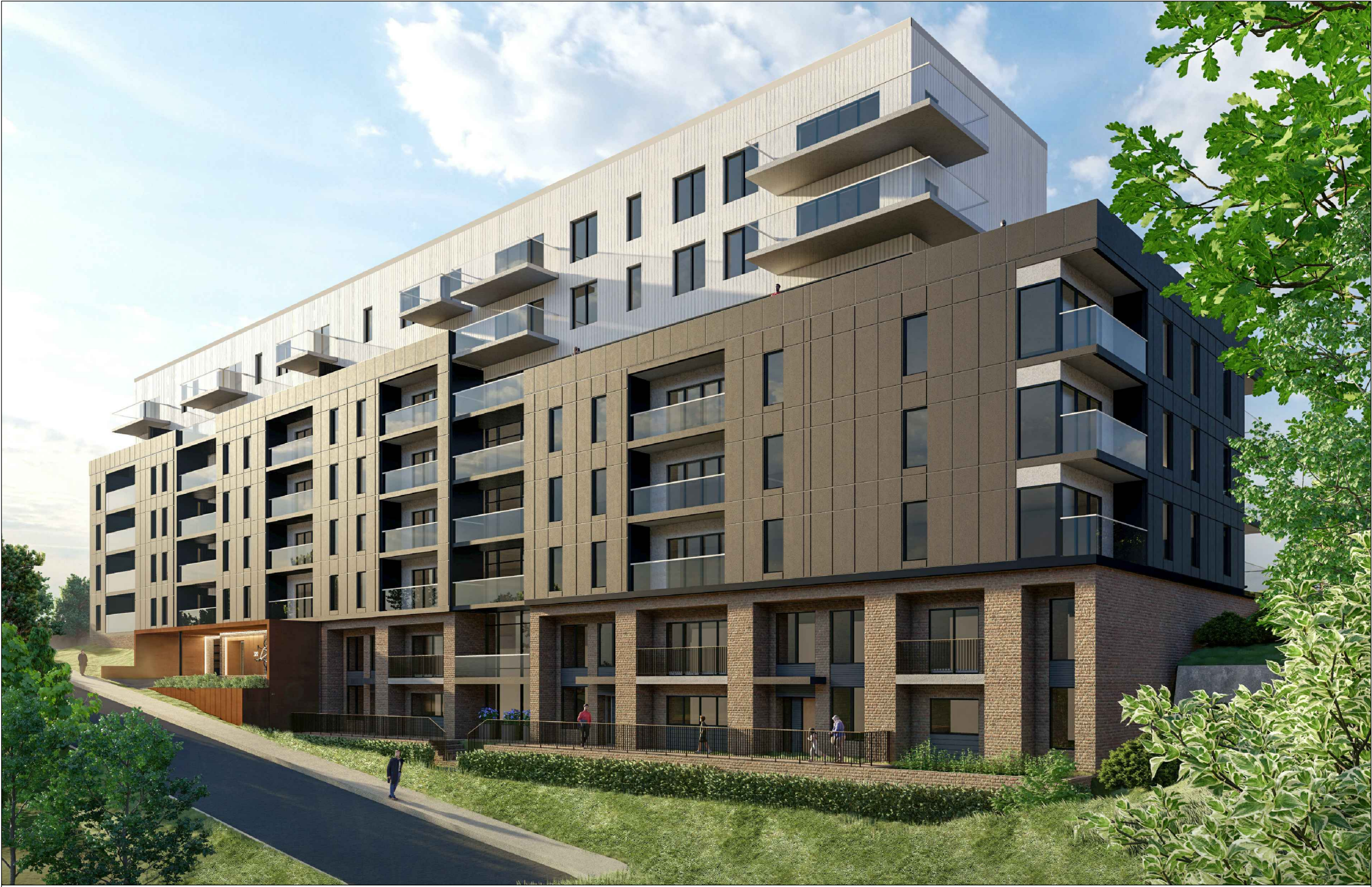
VIEW FACING DRIVEWAY & SACKVILLE DRIVE