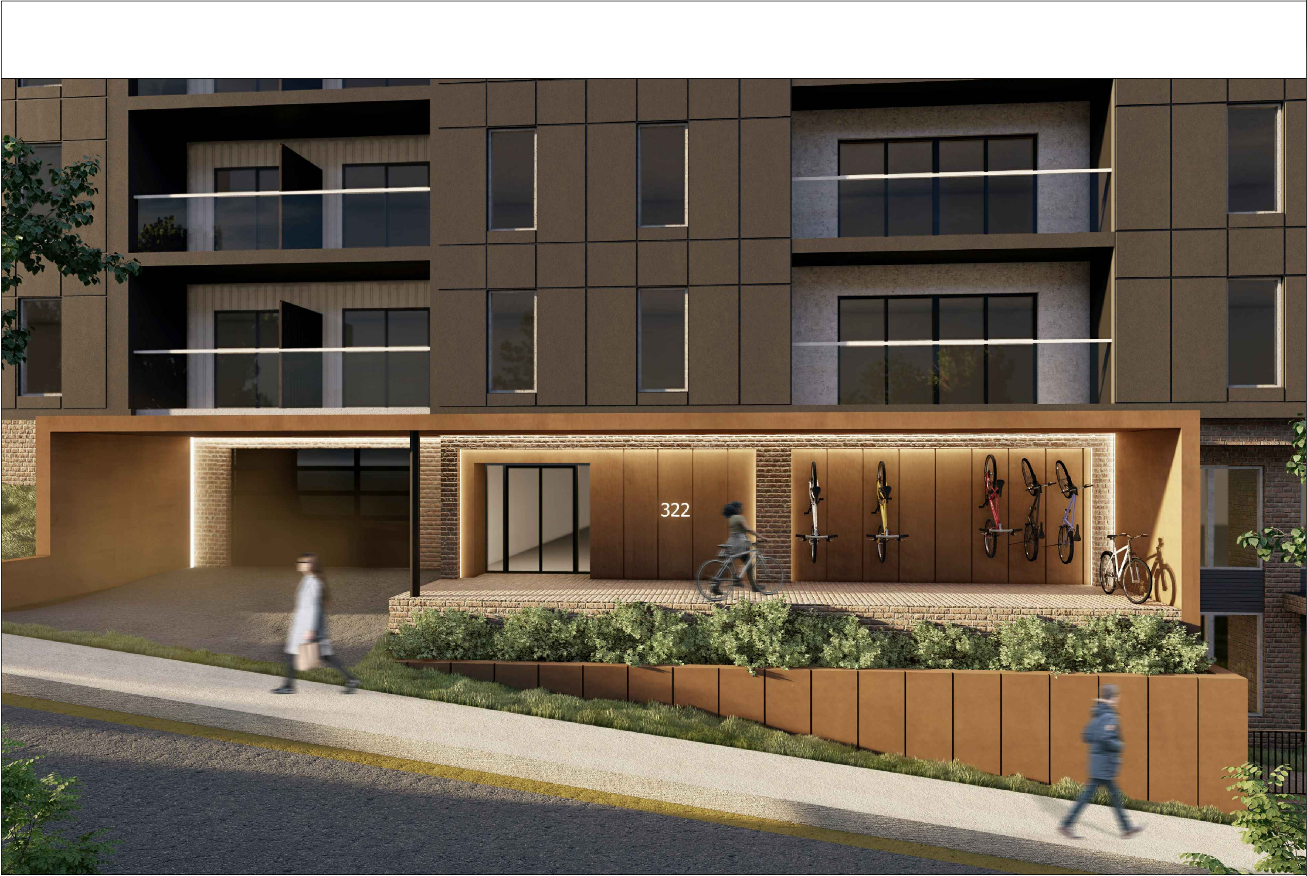
ENTRY FACING DRIVEWAY & SACKVILLE DRIVE