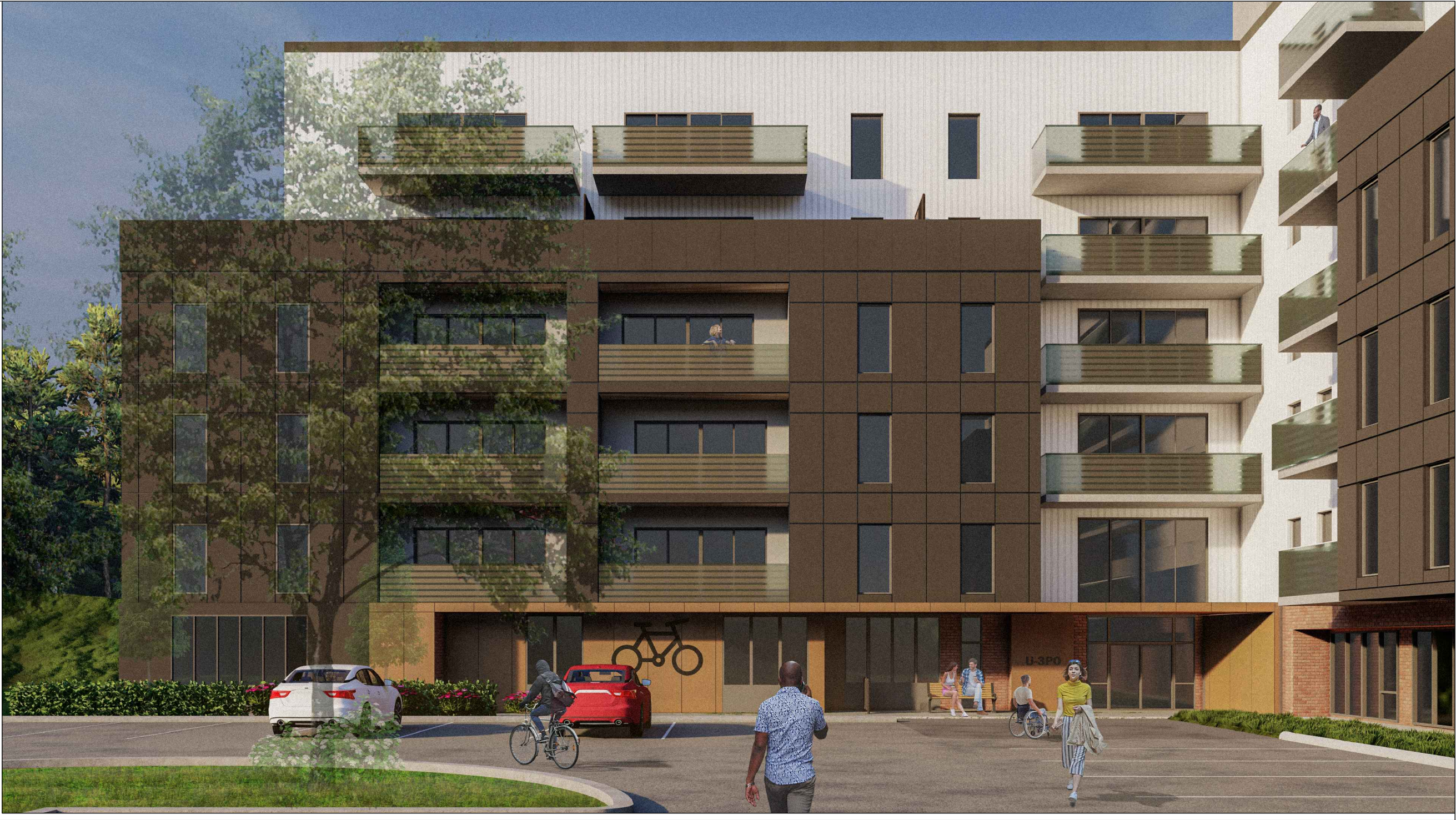
VIEW OF MAIN BUILDING ENTRY FROM SURFACE PARKING