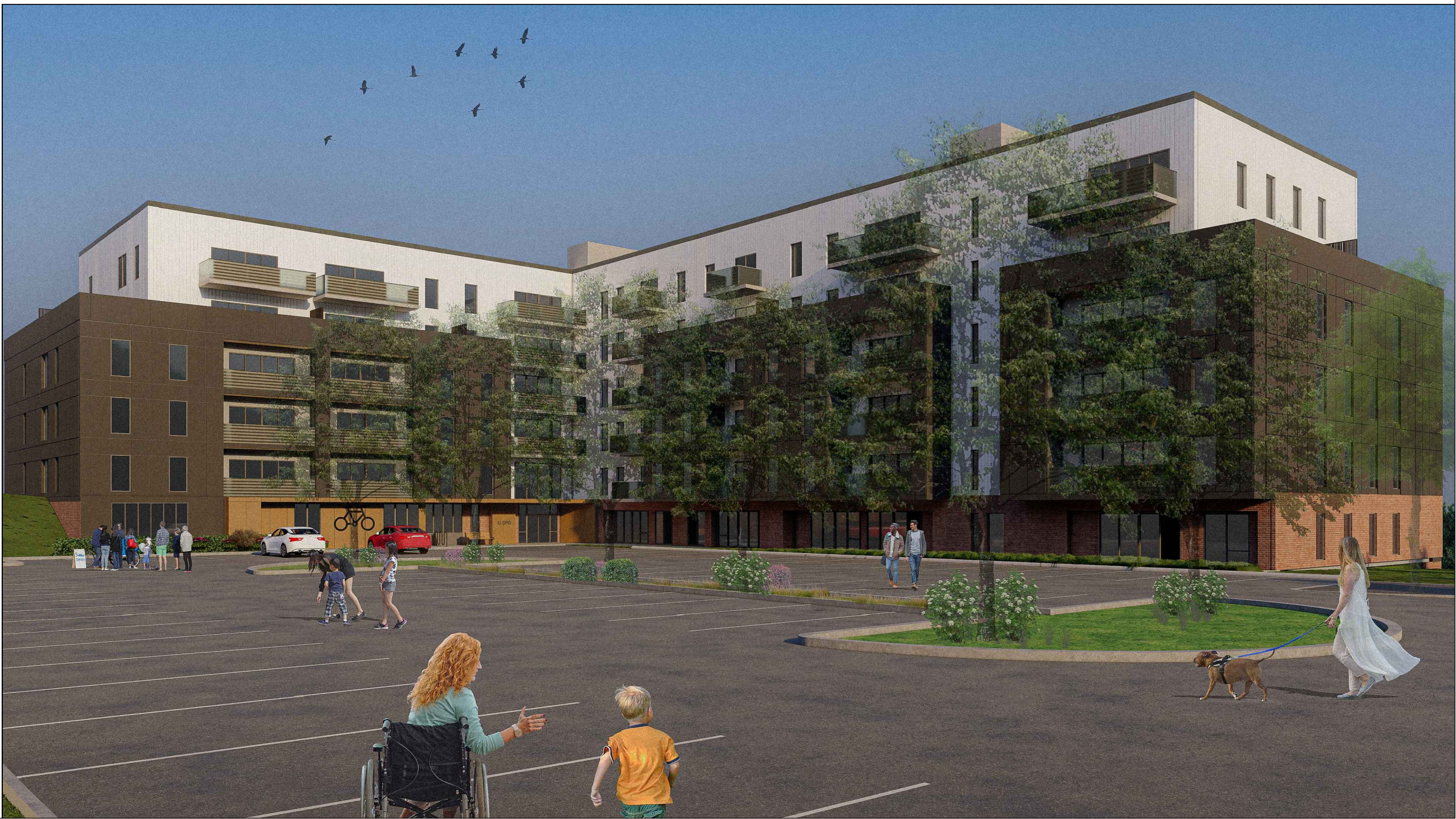
VIEW FROM BACK OF SURFACE PARKING