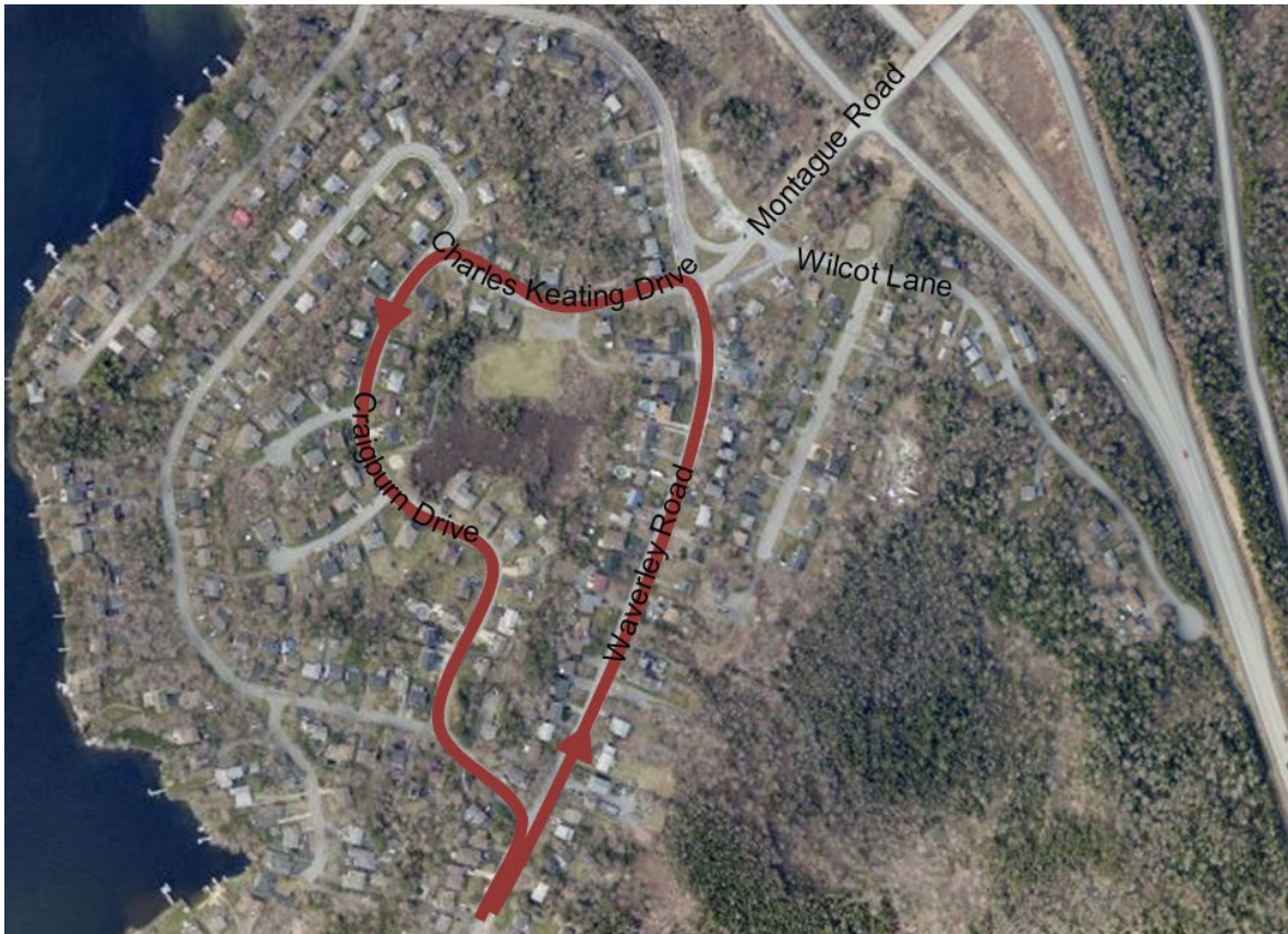
Figure 1: Existing Routing