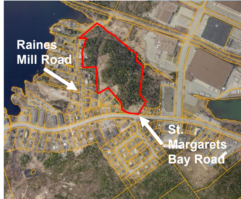
Property boundaries in red