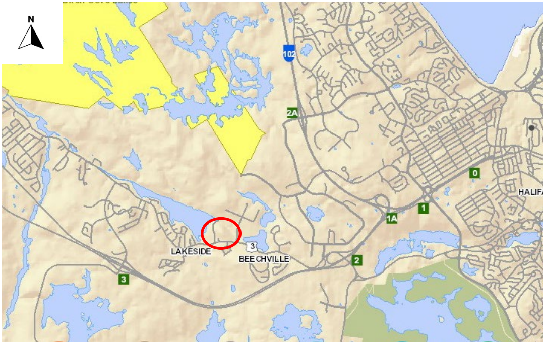
General site location in red