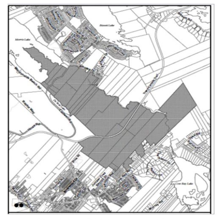
A map of the Morris Lake Extension special development area. - Province of Nova Scotia

In terms of what the three elements of this announcement means for the municipality – as mentioned, the planning and development process for the sites will continue with developers and municipal staff will ultimately bring forward plans for approval to Regional Council, or the Minister through the Housing Task Force, as appropriate.