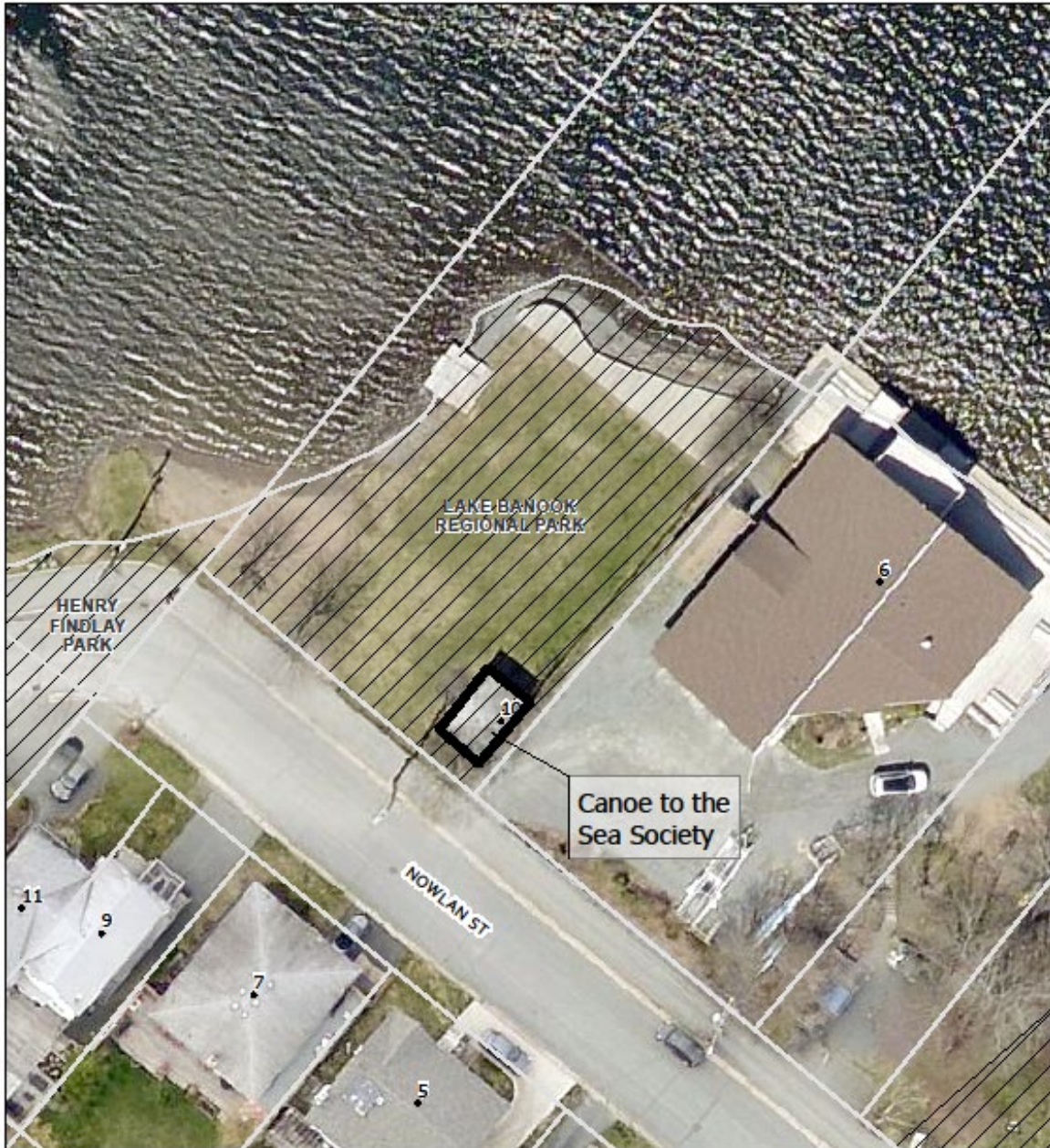
SITE MAP - 10 NOWLAN STREET, DARTMOUTH