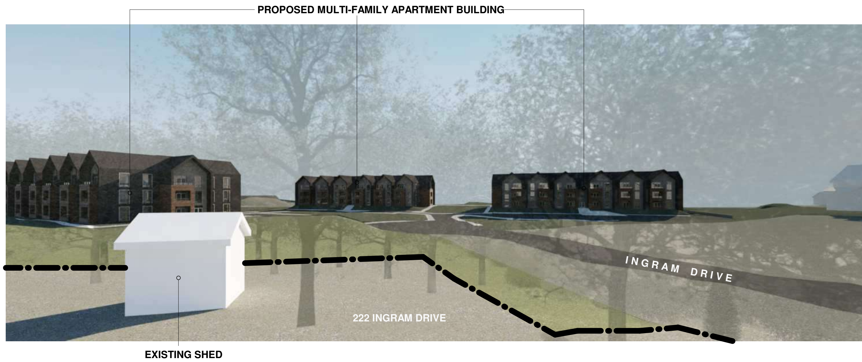
VIEW FROM FRONTYARD OF 222 INGRAM DRIVE