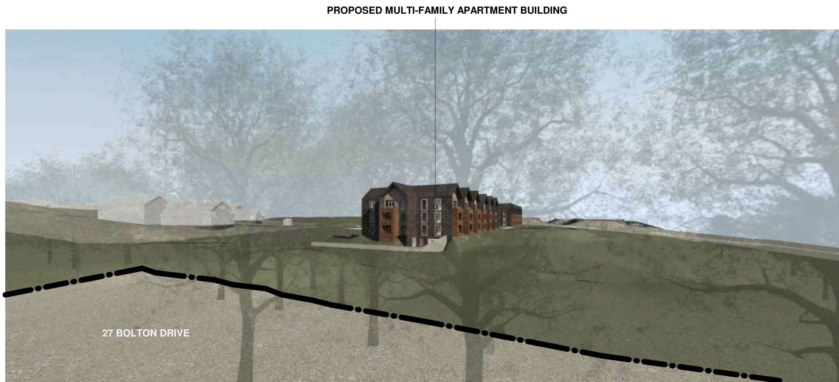
VIEW FROM SIDEYARD OF 27 BOLTON DRIVE

FLORA OPACITY REDUCED FOR GREATER VISIBILITY