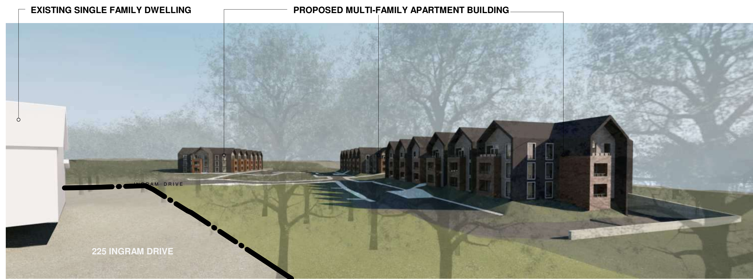
VIEW FROM BACKYARD OF 225 INGRAM DRIVE

FLORA OPACITY REDUCED FOR GREATER VISIBILITY