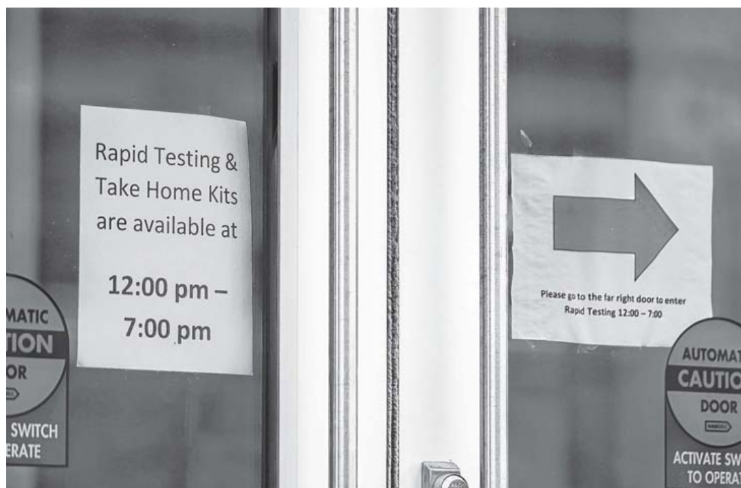
Signs direct people to rapid testing and the pick up of home testing kits at the Halifax Convention Centre on Friday.