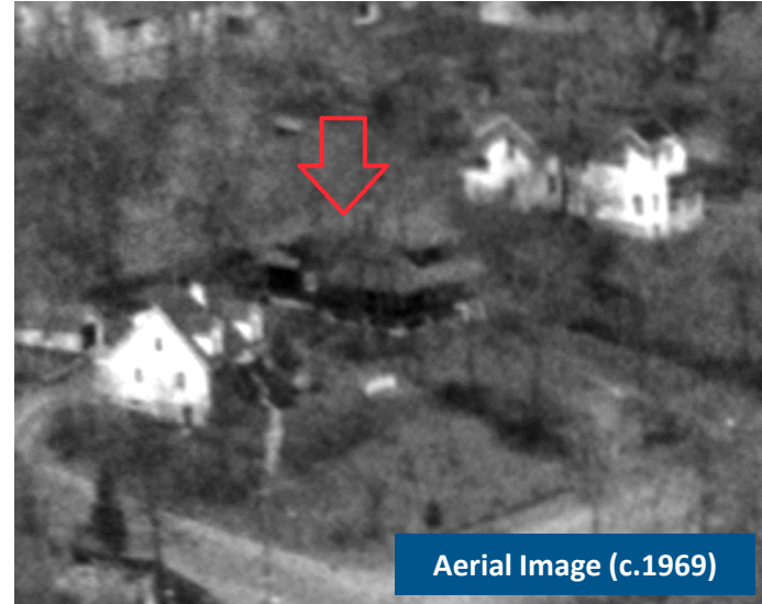
Aerial Image (c.1969)