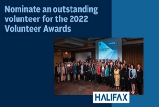
Nominate an outstanding volunteer for the 2022 Volunteer Awards

Do you know an outstanding volunteer who gives back to your community? You can nominate an adult, youth, or group for the 2022 HRM Volunteer Awards until December 15 th , 2021. Nomination forms are available now.