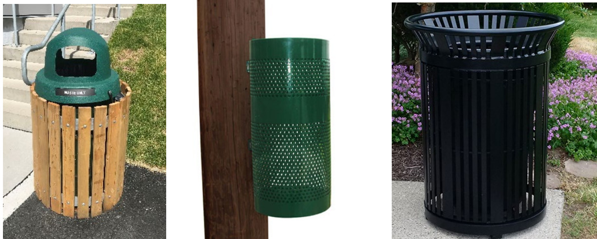
Figure 1: 45-gallon drum with plastic lid; Pole-mounted bins; Ground-mounted Ornamental Bins

Some units, such as ornamental ground-mounted bins generally do not come equipped with lids. These cans have a liner which narrows at the opening, limiting litter being blown out (unless the can is over capacity). Wildlife/rodents cannot access these cans due to the liner. The size of the liner also makes it more difficult for birds to access. The cost of these bins ranges from $655 to $720.