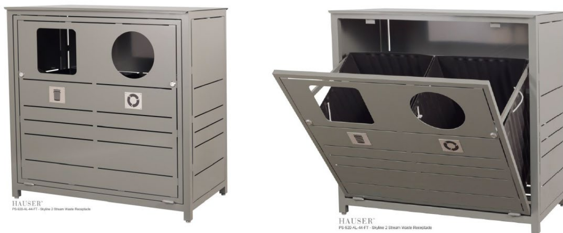
Figure 2: Skyline 2 Stream Waste/Recycle Receptacle - Spring Garden and Cogswell Streetscape

A new style of waste receptacle, illustrated in Figure 2, will be installed as part of the Spring Garden Road Streetscape and Cogswell Interchange Redevelopment. They are animal deterrent in nature and will prevent blowing/scattered litter. They will replace the ground mount ornamental with open tops currently installed in these areas. If these are successful, their use may be expanded throughout the core of both downtown Halifax and Dartmouth, budget permitting. The Municipality has a three-year standing offer for these units at a cost of $3,110 each (2021/2022 pricing).